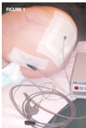
ES therapy set-up