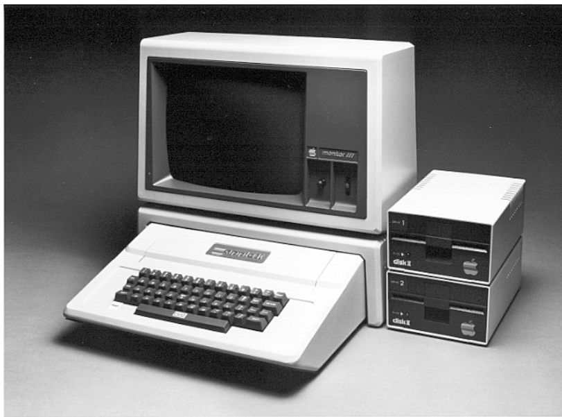
Figure 5.2: Apple II computer, monitor and two disk drives.

Some Apple II boards shipped around May 1977 and the Apple II computer was available to the general public by June at a price of $1,298. The company offered Apple I board owners the option of upgrading to the new Apple II computer. Apple sold about seven thousand Apple II's by the end of 1977.