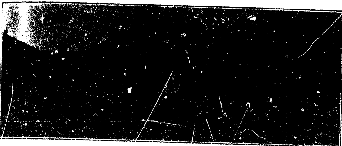
DOG CREEK RESERVE