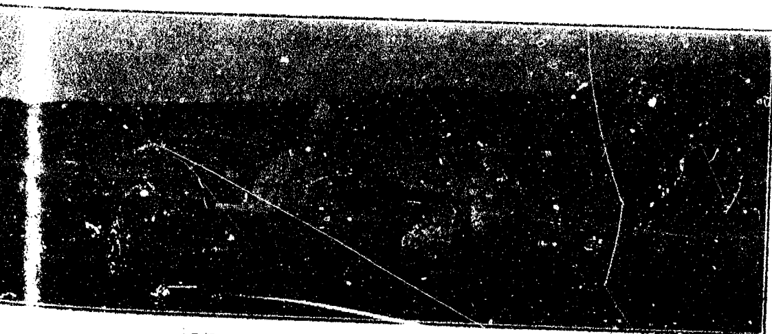
ALKALI LAKE VILLAGE AND RESERVE