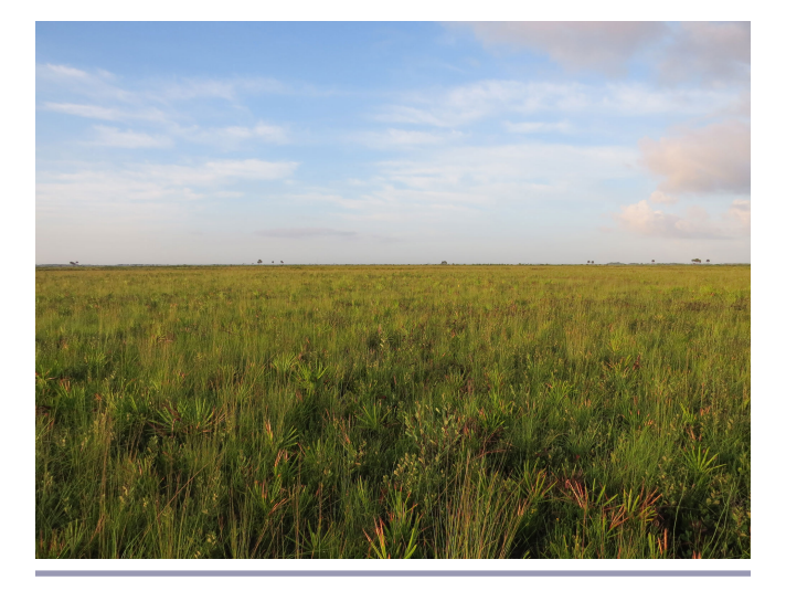
Fig. 1 . Dry prairie habitat at Three Lakes Wildlife Management Area, Osceola County, Florida.

The study area at the Ranch was 1012 ha in size and consisted of semi-improved pasture interspersed with small ponds and hammocks (Fig. 2). The Ranch had been privately managed for cattle grazing for at least 12 years by mowing every two to three years during the dry season (Jan–Apr) and occasional prescribed