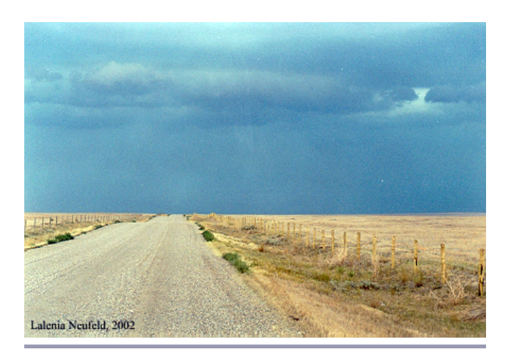
Fig. 1 . Example of a road/fenced edge in our study area, southern Alberta, Canada.

Most roads were gravel and had light traffic. A few roads were paved, and most roads had grassland on both sides. Where fences were present, they consisted of 3-5 strand barbed wire strung between wood or metal fence posts. Approximately 2/3 of the roads had fences on either side, while remaining roads were unfenced. Most roads were adjacent to shallow ditches. There were a few two-track trails that were used for livestock and energy infrastructure management occasionally (once a week to once a day, or less), and we did not consider these to fragment the landscape. Gas well density ranged from 0 to 15 wells/mile<sup>2</sup>. Almost all cropland edges were fenced, but wetlands were unfenced. A few shrubs, i.e., Artemisia cana, were present at low densities, generally covering approximately 0-5% of the surface area of each plot. Raptors and Brown-headed Cowbirds occasionally used utility lines as perch sites, but this was uncommon because the abundance of utility lines was low within our study area.