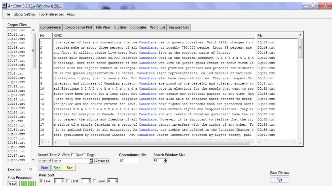
Figure 1: Screenshot of concordance for “Canadians” using AntConc concordance program

In order to map the ways in which these two texts construct particular identities, behaviours, and knowledges as “Canadian,” I have extracted concordances from the texts. Concordances are alphabetically arranged lists of all the examples of a specific word that can be found in a database; the extracted word is presented with a small span of surrounding words that provide a co-text (See Figure 1).