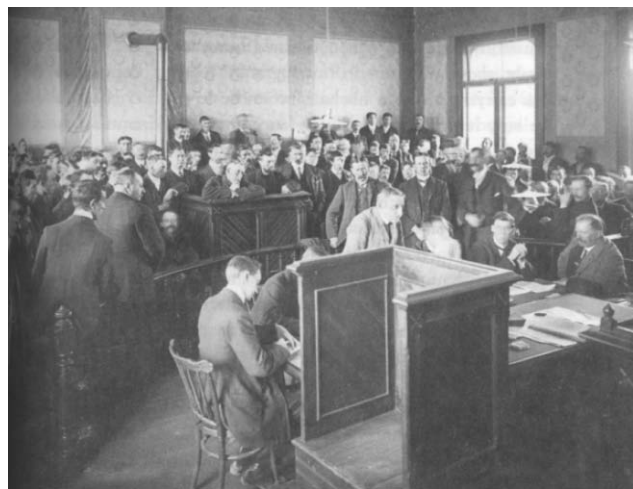
Bill Miner on Trial, Kamloops, 1906