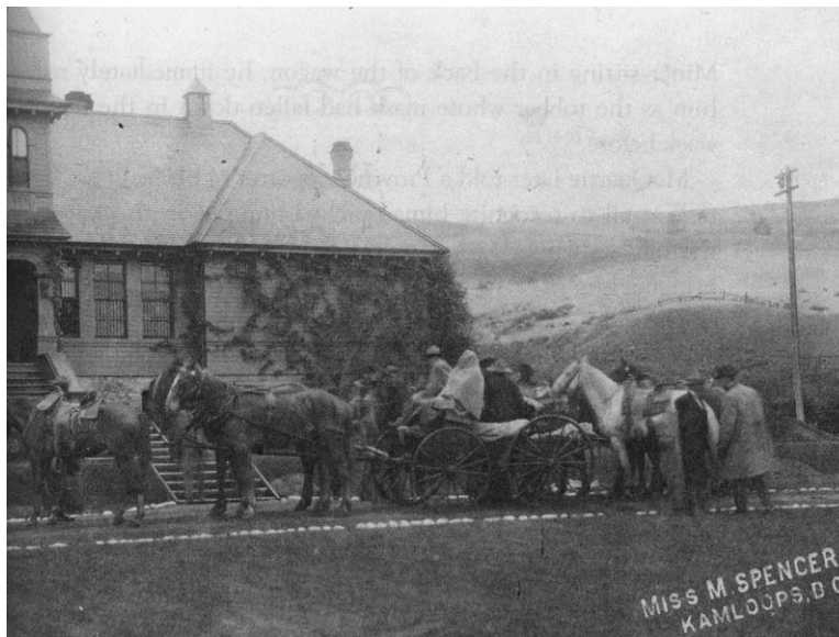
The captured Bill Miner and gang arriving at Kamloops Gaol