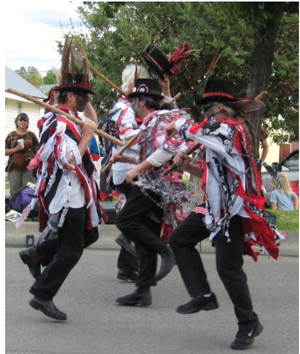
Morris Dancing in the Street

tion of Morris dancing by the Vancouver Morris Men, who have been performing together for thirty years. Go to any street festival in the Lower Mainland and you’ll probably see them with bells ringing and handkerchieves waving. They have also been known to dance on dark, rainy parking lots on Guy Fawkes Night. Apart from this inclusion in the formal program, the group frequently performed spontaneously in the streets of Princeton throughout the weekend, whenever they decided that a little “guerilla dancing” (as they called it) was required to liven the proceedings.