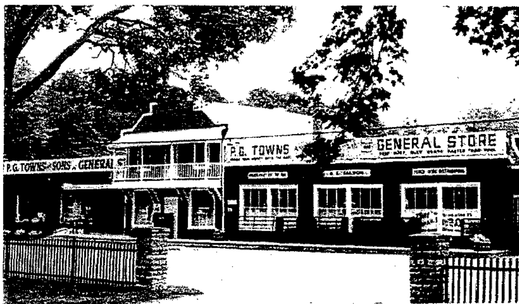
P.G. Towns General Store