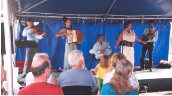
Something About Reptiles

Throughout much of Saturday audience members moving between the stages could stop and watch street performances by Morris dancers, sometimes waving their white handkerchieves, sometimes fiercely beating their rapper sticks (swords) together at key points in the dance. Both the Mossybank Morris Men and the Vancouver Morris Men were up and about again on Sunday too.