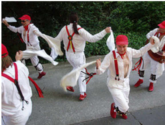
Mossybank Morris Men Dancing with Handkerchiefs

Throughout much of Saturday audience members moving between the stages could stop and watch street performances by Morris dancers, sometimes waving their white handkerchieves, sometimes fiercely beating their rapper sticks (swords) together at key points in the dance. Both the Mossybank Morris Men and the Vancouver Morris Men were up and about again on Sunday too.