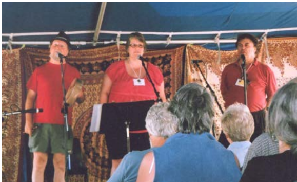
Solidarity Notes Trio at the Ninety-Nine Percent Workshop