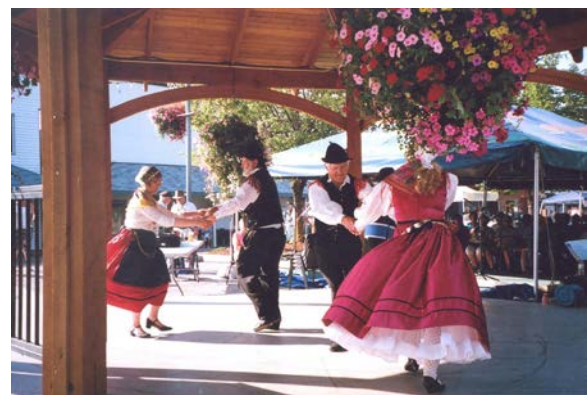
Slovenian Folklore Dancers

Then it was back to the East European theme of the 2012 Festival with the Slovenian Folklore Dancers and Something about Reptiles. The Vancouver Slovenian Society was founded in 1958 and the Slovenian Folklore Dancers began in 1964. Their costumes are of the style worn in Gorenjska, in the Julian Alps. The group performs dances from various parts of Slovenia, some very traditional and some choreographed more recently. They are always accompanied by an accordionist playing traditional tunes. Active in the B.C. Slovenian community, they regularly dance at festivals, cultural events and cultural and seniors' centres.