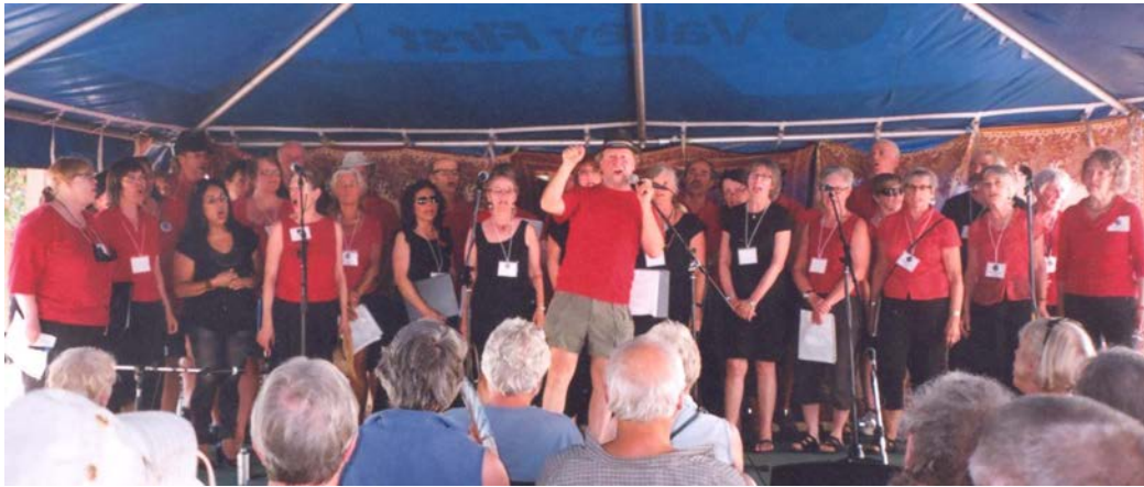
Solidarity Notes Labour Choir

tional French-Canadian and Métis songs with fiddle, foot percussion, banjo, spoons, mandolin, bodhran, harmonica, and jaw harp.