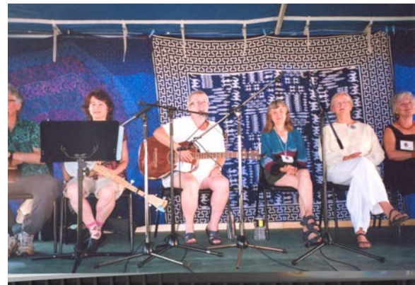
Traditional Ballad Workshop

clearly a case of one hour being insufficient for a workshop in which the narrative songs tend to be lengthy.