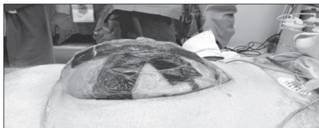
Fig. 1. Patient with an open abdomen demonstrating progressive fascial retraction and loss of abdominal domain during ABThera treatment.

We conducted an institution review board–approved, single-institution, retrospective analysis of patients with an open