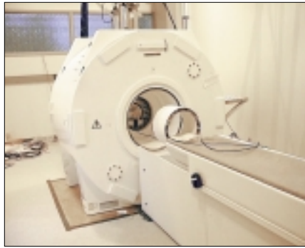
An MRI scanner at St. Boniface