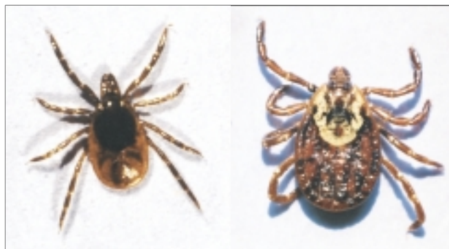
Fig. 1: Left: Blacklegged tick, Ixodes scapularis , unfed adult female. This tick is a competent vector for the spirochete causing Lyme disease, Borrelia burgdorferi . Total body length ranges from 2.0 to 3.5 mm; this specimen is 3.2 mm in length. Right: American dog tick, Dermacentor variabilis , unfed adult female. Total body length ranges from 3.0 to 5.0 mm; this specimen is 4.5 mm in length. This is the tick species most frequently submitted for identification in Ontario; it is not a competent vector for B. burgdorferi . Both ticks are found in southern Ontario.

The hosts of 121 (87%) of the ticks had no reported history of out-of-province travel. Two (1.6%) of these 121 ticks (1 from Mississauga and 1 from Etobicoke [part of Toronto]) produced motile spirochetes, which were subsequently identified as B. burgdorferi by monoclonal antibody and polymerase chain reaction tests (Table 1). In an additional 7 (5.8%) of the 121 ticks, B. burgdorferi was detected directly by polymerase chain reaction (Table 1). The first blood sample from host dogs was normally taken 4–6 weeks after tick removal. Subsequently, serum samples from all 9 dogs were tested by indirect immunofluorescence antibody assay and Western blot to identify specific antibodies against B. burgdorferi ; such antibodies were observed in all samples. In a few cases the indirect immunofluorescence antibody titres were low (Table 1); however, all of the Western blots were reactive, with 5 or more bands needed for identification. Because most dogs with Lyme disease are asymptomatic, Western blot provides valuable diagnostic