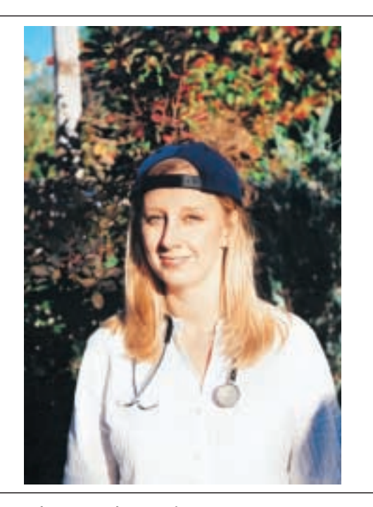
Fig. 1: Traditional (left) and "cool" (right) placements of the stethoscope when not in use.