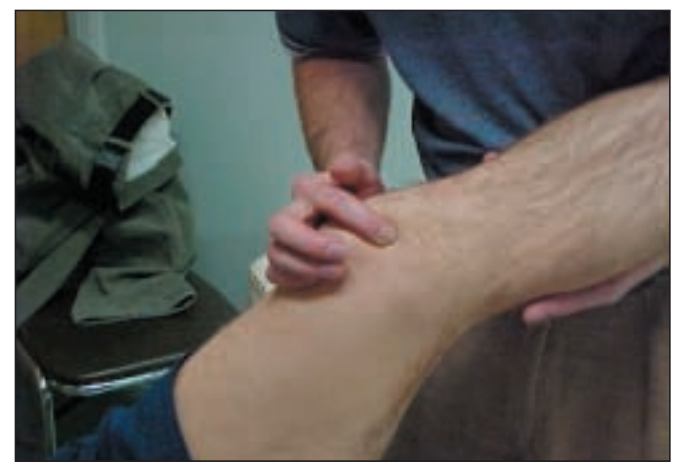
Fig. 6: Palpation for synovial plica.<sup>1</sup>

Analgesics including nonsteroidal anti-inflammatory drugs (oral and topical) play an important role in therapy but should never be the only form of treatment.