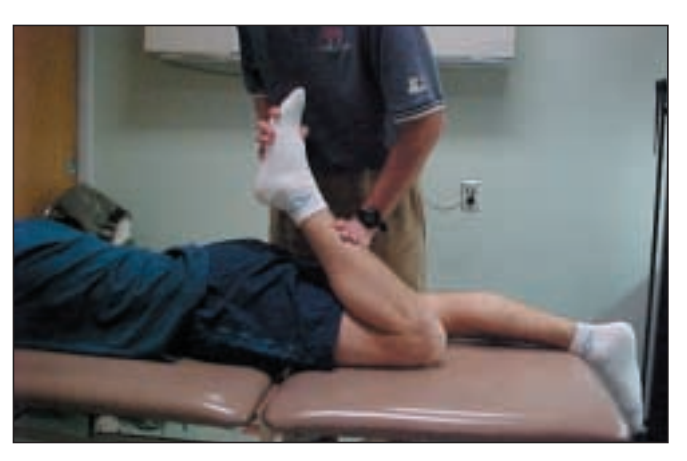
Fig. 3: Measuring quadriceps flexibility.<sup>1</sup>