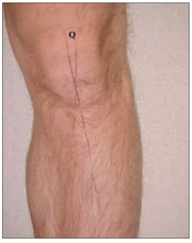
Fig. 1: Quadriceps (Q) angle is the angle between the line of the femur and the line of the patellar tendon.<sup>2</sup>

The medial patellar border is often tender in AKP.