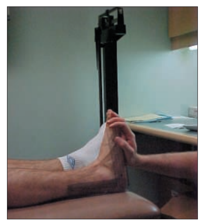
Fig. 4: Measuring heel cord tightness.<sup>1</sup>

A complete assessment of the internal structures of the knee (including the menisci, ligaments and bony surfaces) is