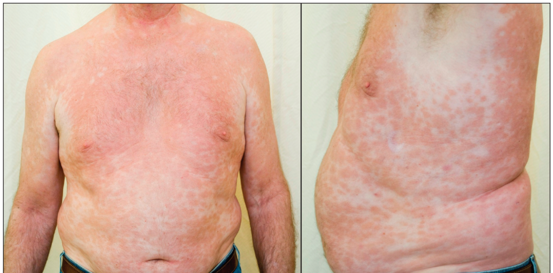
Figure 1: Confluent erythematous, maculopapular, hypoesthetic rash over the trunk and arms of a 60-year-old man with polyarthritis and neuropathy; the armpits, where the skin is warmer, are spared.

On physical examination, he had no fever. He had a confluent erythematous, maculopapular, hypoesthetic rash on his face, trunk and limbs that spared the warmer areas of the body (Figure 1). Other dermatologic findings included thickening of the skin over his nose and loss of his eyebrows.