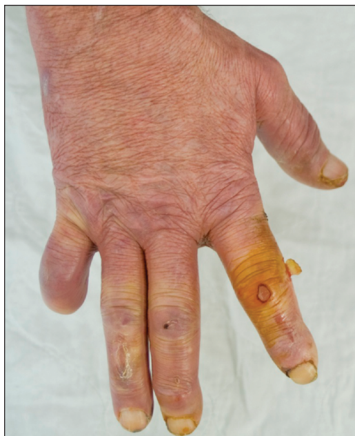
Figure 2: Swollen fingers and hand, with traumatic lacerations and burn marks on fingers. The amputation of the fifth finger was accidental and not related to the patient's pathology.

We measured the patient's blood arsenic level (c) and performed a skin biopsy (d). Chronic arsenic intoxication may present with peripheral neuropathy and hypopigmented or hyperpigmented skin