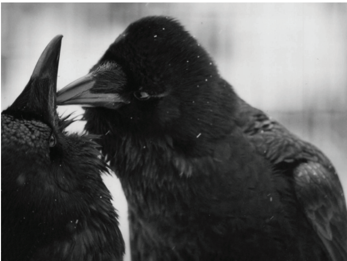
Figure 3. An illustration of ravens engaging in preening, which is an analogue to grooming in primates.

As in primates (Fraser, Stahl and Aureli, 2008; Fraser, Koski, Wittig and Aureli, 2009), the components of relationship quality are a good predictor for the ravens' behavior during and after conflicts (Fraser and Bugnyar, 2010b, 2011, 2012). Birds may provide help in ongoing conflicts by joining others in fights and/or chases, whereby they tend to support their kin and those who preened them and helped them before (Fraser and Bugnyar, 2012). Ravens may also show post-conflict behavior when they were engaged in the