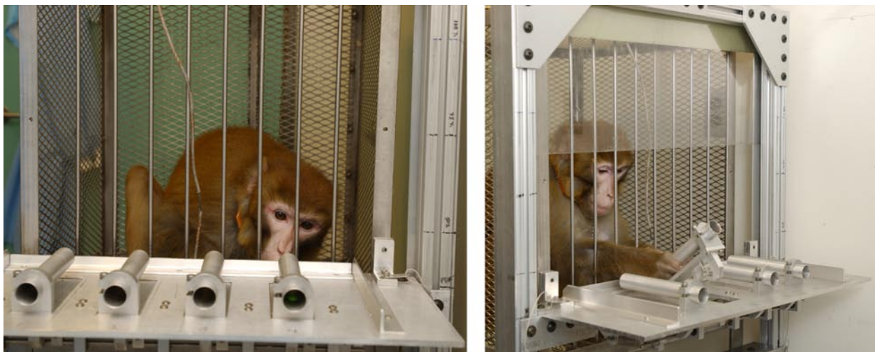
Figure 2. Left, a rhesus monkey, ignorant of the food's location, collects more information before making a choice. Right, an informed monkey makes a choice without going to the effort of confirming the location of the food. Such selective information seeking suggests that the monkey knows when he knows, and only seeks more information as needed.