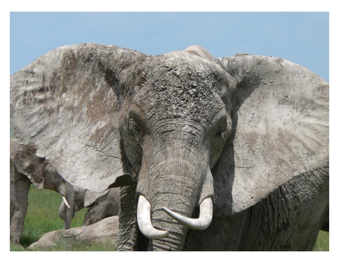
Figure 1. At Amboseli, researchers can recognize over 1400 elephant individuals. Often the ears give the first clues to an individual's identity: overall shape, the pattern of veins and damage to the edges all differ.

Elephants are capable of producing different sounds ranging from 5 Hz to over 9,000 Hz (Poole & Granli, 2003) resulting in a broad range of vocalizations from very low frequency rumbles to higher frequency trumpets and barks (Berg, 1983). However, elephants are specialists in the production of low frequency sound, with the most often produced vocalizations being low frequency rumbles; the lowest, infrasonic, components of these rumbles can be between one and two octaves below the lower limit of human hearing (Poole & Granli, 2003). Although the lower range limit of elephants' hearing has not been established, they are known to be more sensitive to low frequency sounds, and less so the high frequency sounds, than any other mammal so far tested (Heffner & Heffner, 1982).