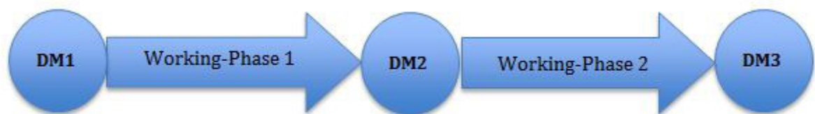
Figure 1. Temporal pattern of group collaboration process.

A temporal pattern of group behavior changes across the six groups is presented in Figure 1. The figure represents how the groups moved toward making decisions that were necessary for completing the group paper. All the groups went through three decision-making points (DM1, DM2, and DM3) and had two working-phases (working-phase 1 and 2) between the decision-making points. The first decision-making point (DM1) was for selecting a problem from the given two options. The second decision (DM2) was for structuring the group paper that was going to be the basis for dividing the task into individual portions. The final decision (DM3) was to reach a consensus for completing and submitting the paper. During working-phase 1, the groups that had selected problem option 1 spent time mostly on reading the documents provided on the course Web site while the other groups working with option 2 was brainstorming to create an imaginary context of a case. The working-phase 2 was a time period of writing individually, commenting on each other's works, compiling the individual pieces, and editing the compiled paper.