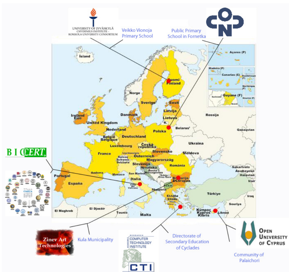
Figure 1. The REVIT partnership.

The REVIT project placed a good deal of effort in conducting an extensive analysis and a comprehensive evaluation. The methodology and the results of the evaluation phase of the REVIT project are available online (Dagdilelis, 2010) while this paper focuses on the analysis phase. Design, development, and implementation can be treated as a 'black box', since the combination of the pre-analysis and the post-evaluation confirms that the needs were met, given the actual commitment of the learners.