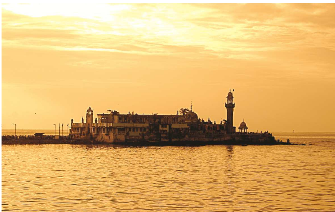
Figure 1: Haji Ali Dargah.

There are three big landmarks – Haji Ali Dargah, Gateway of India and Bandra-Worli sea link – that have come to define the identifiable milestones of the complex historiography of Mumbai. The narrative architecture of each one is deeply intersected with multiple imaginaries of the sea and the coast.