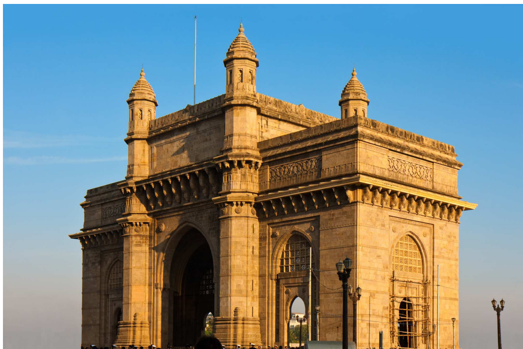
Figure 2: Gateway of India.