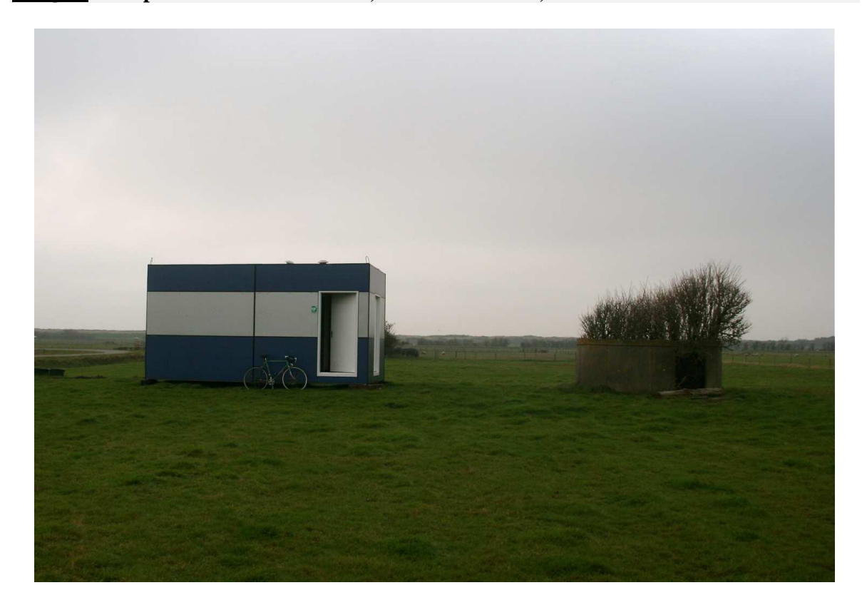
Image 1: The portable studio. Hollum, The Netherlands, November 2012.

To begin somewhere, as we must all do, I started where I began. I was born and raised on Ameland, an island in the north of The Netherlands. But I do not live there anymore. Ameland used to flourish because of the whaling business — my parents still have a fence of whale bones in the garden — but tourism is the main occupation and greatest source of income today.