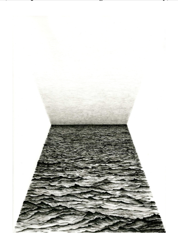
Image 2: Horizon, 2013: pen and ink drawing made on Grímsey, 29.7 x 42 cm.

At the end of 2012, I did a short residency at Gallery Dit Eiland on Ameland. I worked in a portable cabin in a pasture, outside the village of Hollum (see <a href="Image 1">Image 1</a>). I made drawings and wrote while researching my subject. In January 2013, I travelled to Grímsey, a small island north of Iceland to work and experience the island itself, apart from mass tourism, social connections and a shared history. I was the only stranger in a small community, a position I have never envied (but it wasn't that bad). From the window of the house I stayed in, I could observe the 'other side', the mainland, and the boat coming and going. The weather changed a lot while I was there. It was of interest to be in a place where I could observe frequent shifts of the horizon (see <a href="Image 2">Image 2</a>), from a clear view of the mainland to almost zero visibility, and to be closed off from the outside world for a couple of days during a storm.