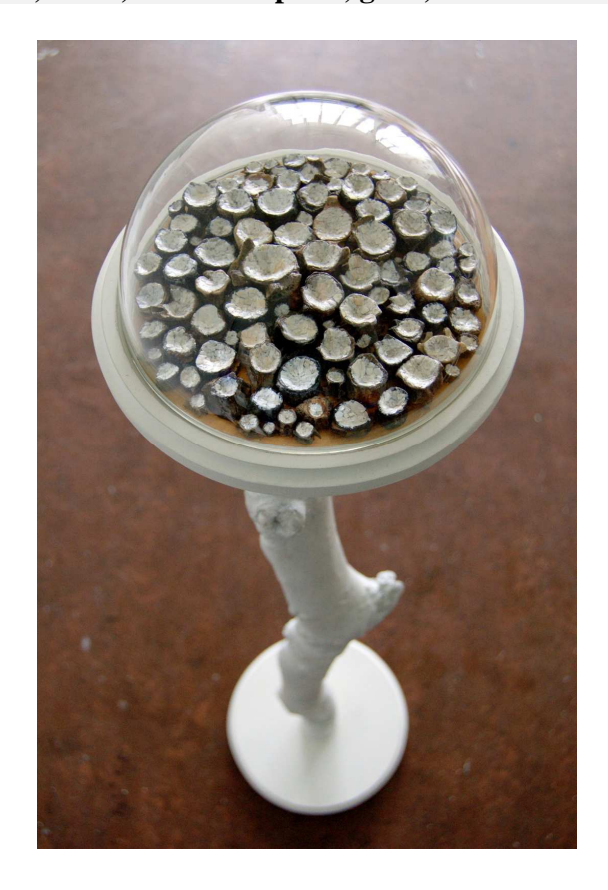
Image 6 : Us, 2013: bone, wood, mother of pearl, glass, 114 x 26.5 cm.

I made the work Us (see <u>Images 6 & 9)</u> from bone, wood and mother of pearl. The bones are fossil fish bones that I find beachcombing. I took the mother of pearl that I laid inside these barnacle-like shapes from blue mussel shells, found on both Ameland and Grímsey. I also used mother of pearl as a reference to nearly all islands having a nickname with the word 'pearl' in it and because of the characteristic of protecting the animal from parasites and dirt.