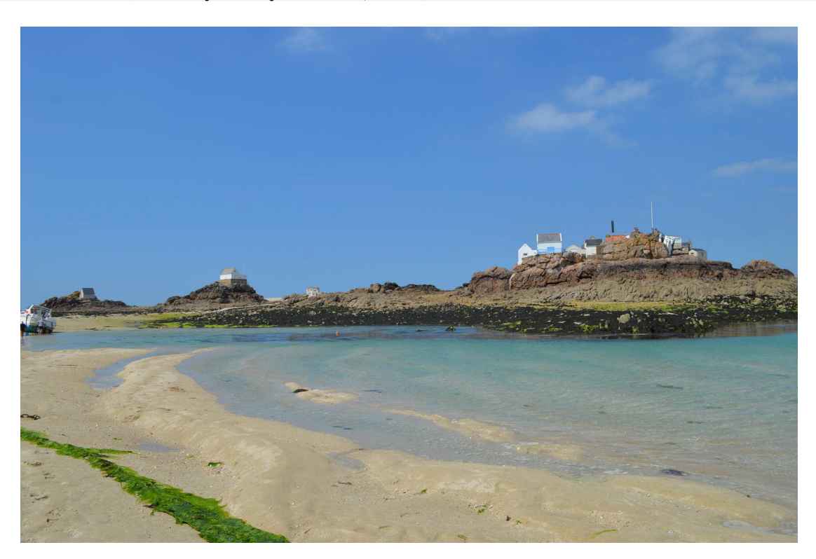
<u>Figure 2</u>: Écréhous at low tide. Right of photo: La Marmotière; left of photo: several smaller islets.

Along with the main Channel Islands (e.g., Jersey, Guernsey, Alderney, Sark and Herm), these two shelves are situated in different parts of the pronounced Gulf of St Malo in the northern French coastline (between Normandy and Brittany). This area is characterized by challenging marine conditions due to the combination of two overriding major factors: the presence of countless rocks and sand, and the strength and range of tidal currents, which are among the highest in the world (up to 12 metres). These two factors combine to make the tidal waters around the Minquiers and Écréhous to be especially dangerous, yet also creating a very changeable amphibious and distinct seascape/landscape. As one hut owner on the Minquiers noted in response to a short survey: "The Minquiers plateau is an area of unique, constantly and dynamically changing beauty. It is a place to enjoy vast skies, and multi-toned sea, rocks and sand" (Anon, 2015, personal communication). With both reefs, and especially with the Minquiers, only a few rocks remain above the high-water mark, whereas at low tide a huge plateau is uncovered, along with a number of rocks, sandbars and sea inbetween. Added to the fact that the situation is never the same depending on the time of day due to the tidal