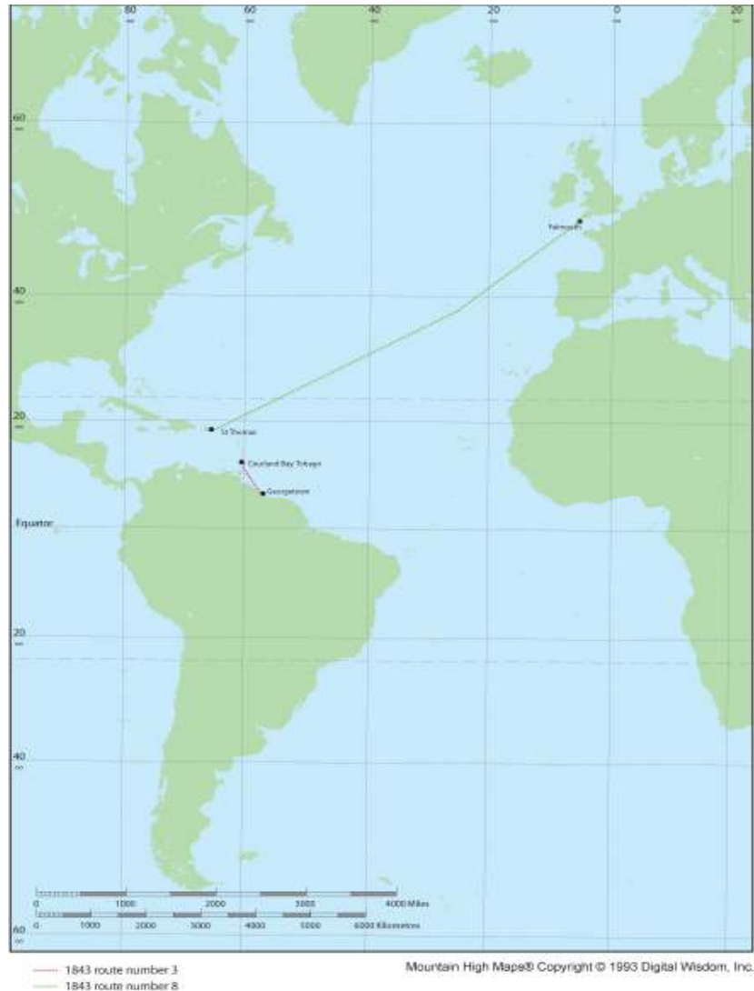
Figure 2: The RMSPC's May 1843 route scheme, showing routes 3 and 8.

Networked approaches have enabled “new imperial” scholars to examine the multiple projects and sites of empire, bringing metropolitan and colonial spaces into a single frame of analysis (Cooper & Stoler, 1997; Lambert & Lester, 2006, pp. 8–9; Wilson, 2004). While there is a wealth of recent work examining imperial trajectories and social as well as business networks (see, for example, Laidlaw, 2005; Ward, 2009), “it remains to develop a more detailed and materially ‘grounded’ understanding of the intricately fabricated imperial networks that actually linked colony and metropole together” (Lester, 2002, p. 30). In this paper, the RMSPC is considered as such a materialized network, specifically one that provided transportation and communication links in British imperial and extra-imperial spaces. Transport infrastructures such as steamship services were “complex fabrication[s]”, characterized by improvisation and relationality, and always in process (Ballantyne, 2002, p. 15). Furthermore, steamship networks, like imperial webs, comprised both vertical relations and crucial “horizontal linkages between colonies” (ibid.).