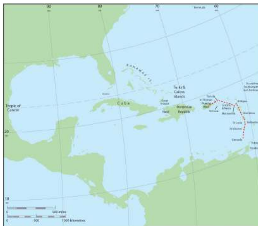
Figure 3: The RMSPC's 1843 Northern Islands route.