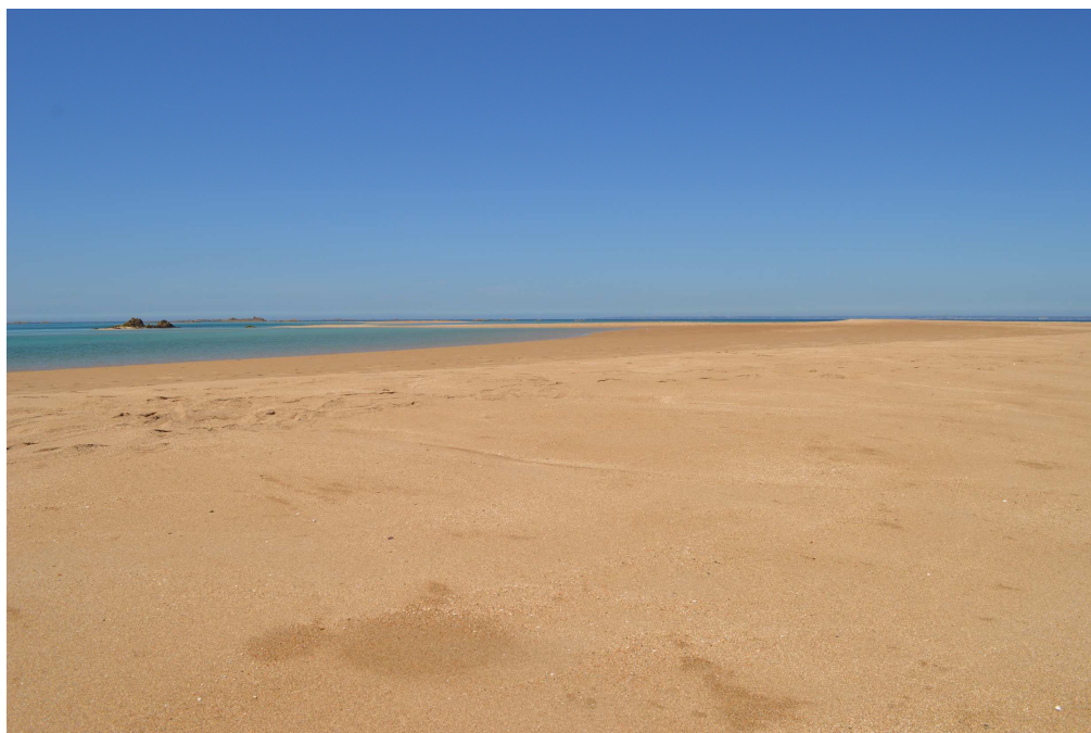
Figure 3: Sandbank at the Minquiers.

Moreover, “the uninhabited reefs and rocks are an important part of the horizon view from the more developed coast of Jersey” (States of Jersey Planning and Environment Committee, 1999, 240), and “the special sense of remoteness and wideness is being eroded by increasing human disturbance” (States of Jersey Planning and Environment Committee, 1999, p. 240). From the French side, the uniqueness of the Minquiers and Écréhous reefs is distinctly singled out in some promotional brochures of a handful of sea excursion companies operating from the port of Granville. As an example, one of these companies, Le Courier des Iles, describes the Minquiers in a representative manner as follows: “A huge chaos of reefs and sandbanks crossed by violent streams. Inviolable territory of countless seabirds. Vision of another world, you are at the heart of the most powerful tides in Europe. Very few people before you have had the privilege of experiencing this unique landscape” (Le Courier des Iles, 2015, authors’ translation). Adding to a sense of adventure tourism, this company operates several motor yachts and a high-speed RIB to the Minquiers.