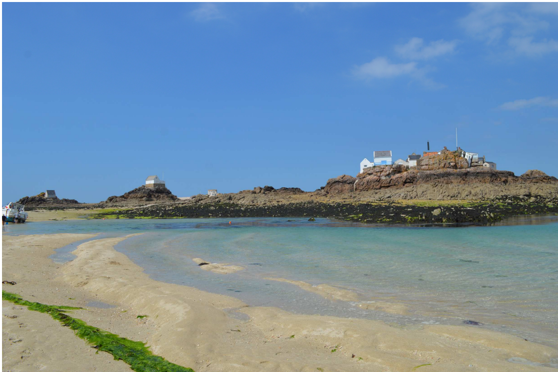
Figure 2: Écréhous at low tide. Right of photo: La Marmotière; left of photo: several smaller islets.

Along with the main Channel Islands (e.g., Jersey, Guernsey, Alderney, Sark and Herm), these two shelves are situated in different parts of the pronounced Gulf of St Malo in the northern French coastline (between Normandy and Brittany). This area is characterized by challenging marine conditions due to the combination of two overriding major factors: the presence of countless rocks and sand, and the strength and range of tidal currents, which are among the highest in the world (up to 12 metres). These two factors combine to make the tidal waters around the Minquiers and Écréhous to be especially dangerous, yet also creating a very changeable amphibious and distinct seascape/landscape. As one hut owner on the Minquiers noted in response to a short survey: "The Minquiers plateau is an area of unique, constantly and dynamically changing beauty. It is a place to enjoy vast skies, and multi-toned sea, rocks and sand" (Anon, 2015, personal communication). With both reefs, and especially with the Minquiers, only a few rocks remain above the high-water mark, whereas at low tide a huge plateau is uncovered, along with a number of rocks, sandbars and sea inbetween. Added to the fact that the situation is never the same depending on the time of day due to the tidal