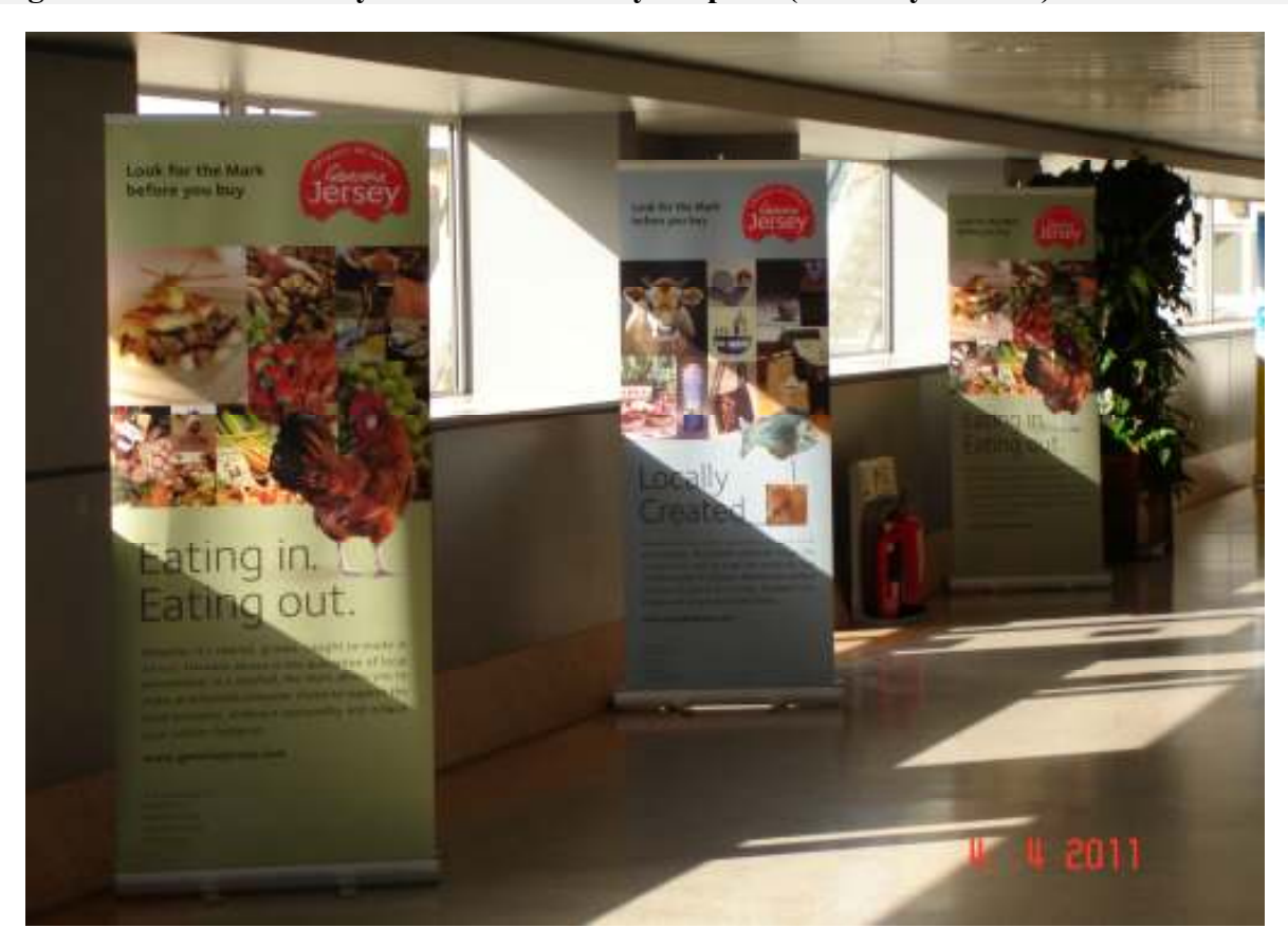
Figure 2: 'Genuine Jersey' Banners at Jersey Airport.

This company, as one example, has aims that are almost identical with those of Genuine Jersey, yet it is not a current member and thus is establishing its own brand. In such a context, some brands might actually be disassociating themselves with collective brands of the public-private type. Genuine Jersey has now been in existence for over ten years, and it has increased its membership on an annual basis. It is forming a brand that will suit the products and produce of some Jersey businesses and not others. In forging its overall membership, the organization is creating a division on the island regarding businesses that have an affiliation with Genuine Jersey and those that do not. Some businesses are not members either because they do not fulfill the selection criteria, or because they have chosen not to become affiliated with the organization. While such a topic is the study for future research, it will suffice to say here that the only main incentive in staying away from this brand, even if fulfilling membership criteria, would be in terms of being able to offer an alternative brand that has the ability to function in its own right and not associate itself with a collective based on authenticity.