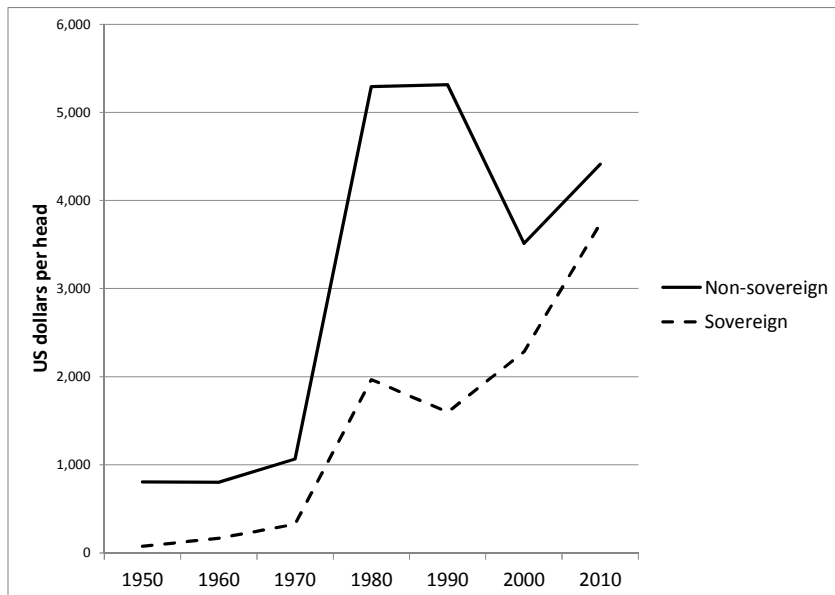
Figure 2: Population-weighted imports per head, US dollars, sovereign versus non-sovereign island economies.

Both McElroy, and myself in previous work (Bertram, 2004), have advanced the hypothesis that affiliated political status has caused, rather than simply accompanied, greater prosperity than could have been achieved under sovereignty. Central to testing this theory is the issue of whether the two groups of island economies – those that are now sovereign states, and those (still) affiliated to metropolitan patrons – started out at similar levels of income, literacy, health status, life expectancy and so on at the end of the colonial era. There is evidence that provides some support for this view, particularly in the Caribbean where an excellent long-term data series from the early nineteenth century is now available (Bulmer-Thomas, 2012). Figure 3 summarizes Bulmer-Thomas’s data on GDP per capita from 1960-1998; here, it does look as though political status may have affected growth paths.