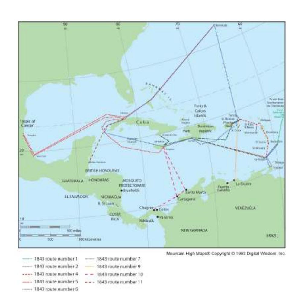
<u>Figure 1:</u> The RMSPC's May 1843 route scheme; routes 3 and 8 not shown. Southampton subsequently became the British port of departure and arrival for RMSPC steamers.