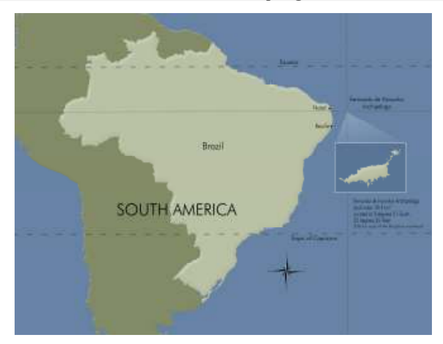
Figure 1: Location of Fernando de Noronha Archipelago, Brazil.