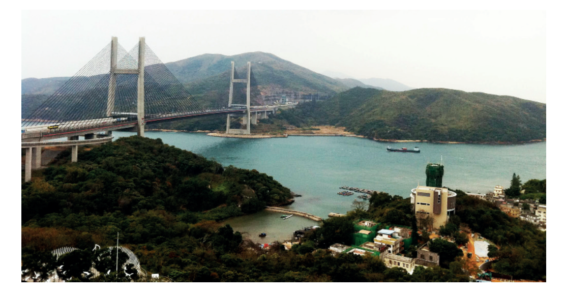
Figure 3: A series of bridges connect the peripheral islands of Lantau Island, Ma Wan, and Tsing Yi to the urban core of Kowloon and Hong Kong (Photo taken at Ma Wan).

Fully infrastructure-connected island communities (FIC): These islands are bounded by water on all sides but are now connected with one or more fixed links such as bridges or tunnels. Hong Kong Island, Tsing Yi, and the pockets of island communities on Lantau Island are the key examples in this category (Figure 3). These islands have experienced rapid development and population growth within a few years after the completion of fixed infrastructures.