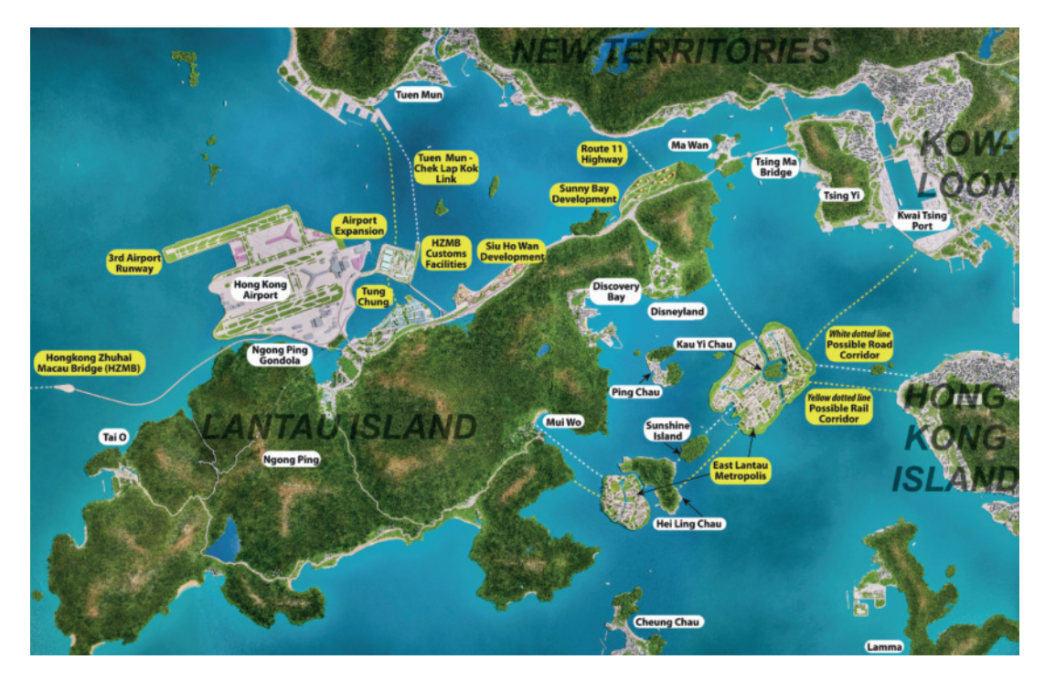
Figure 5: Annotated image from the Physical Model of Lantau Development Plan showing proposed future development plan of Lantau Island. Yellow labels denote future projects, whereas white labels are existing features.