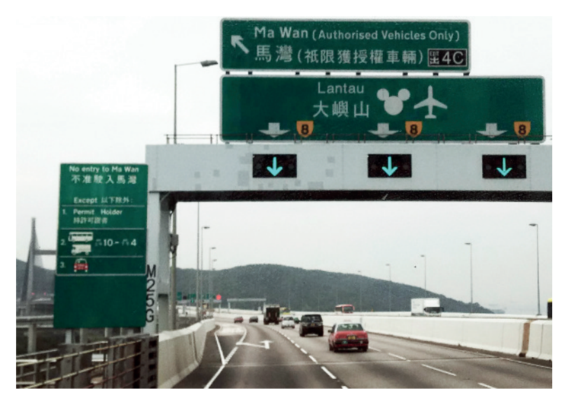
Figure 4: Although Ma Wan is connected by Tsing Ma Bridge, there is restricted access for private vehicles (Photo taken at before the highway ramp into Ma Wan).

'Lost Islands' connected to mainland by reclamation (L): These are islands once separated from the mainland that are now contiguous with the mainland through artificial land creation. A notable example is Stonecutters Island which has been used as a military base by both British (before handover) and Chinese garrisons (after handover) in Hong Kong. In 1990 the island was connected to Kowloon by reclamation to provide land for the extension of Kwai Tsing Container Terminal and a centralised sewage treatment plant. This island does not have a permanent civilian population.