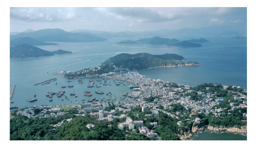
Figure 2: Cheung Chau Island which is currently isolated by sea and relies on ferry transportation.

Fully infrastructure-connected island communities (FIC): These islands are bounded by water on all sides but are now connected with one or more fixed links such as bridges or tunnels. Hong Kong Island, Tsing Yi, and the pockets of island communities on Lantau Island are the key examples in this category (Figure 3). These islands have experienced rapid development and population growth within a few years after the completion of fixed infrastructures.