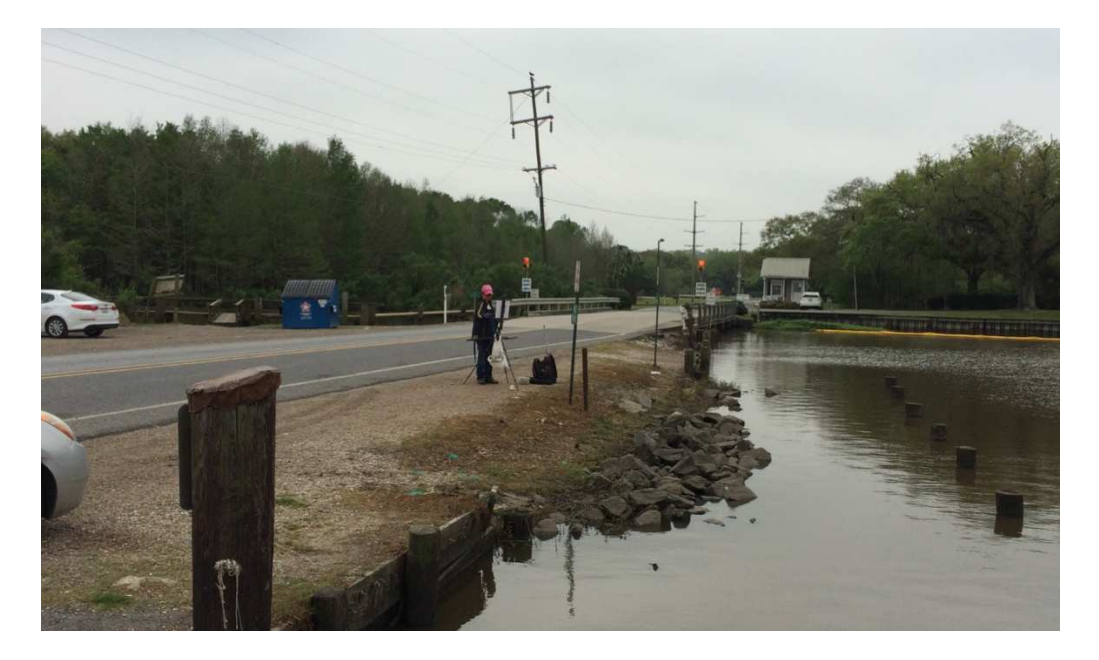
Figure 2: Approach to Avery Island and bridge gatehouse<sup>19</sup>.

gardens and remnant old growth trees, and salt and oil mine areas that are preceded by 'no trespassing' signs and then marked by fences and by security patrols.