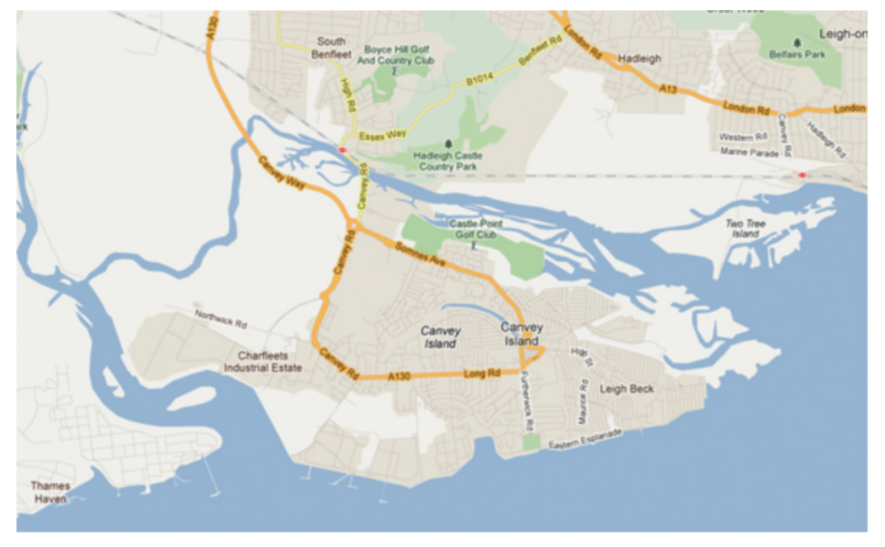
Figure 1: Map of present-day configuration of Canvey.

Within the scenario sketched above, Canvey Island represents a detail within a national quilt whose threads have been stretched in recent decades, distorting individual designs and wrinkling the symmetries necessary for its recognition as a coherent entity. In this regard, the tiny panel at the bottom right-hand corner of the quilt depicting Canvey Island does not so much represent the greater design in micro but rather is one instance of the heterogeneity of elements represented as coherent but currently in a state of crisis. It is also a panel that sits on the edges of one of the quilt's richest and most ornate designs—one whose size and magnificence dominates a large portion but is also oddly out of fit with other parts—that of London, the UK's economic and institutional heart and one of its most established multicultural cities. As the following sections make apparent, Canvey's panel has, in large part, been fabricated from the off-cuts and discarded threads of London's, reflecting the patchwork identity of the island (itself stitched together from earlier fragments of land).