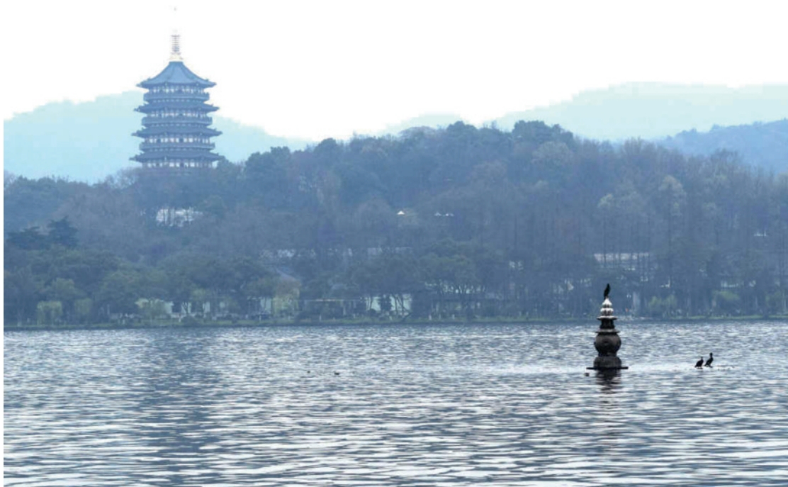
Figure 3: View out across West Lake from Little Yingzhou, with a stone pagoda of Three Pools Mirroring the Moon in the foreground.

A roughly contemporaneous adaptation of the ‘one lake, three mountains’ design is present in West Lake 西湖, Hangzhou. West Lake contains a number of artificial islands, including Little Yingzhou 小瀛洲, constructed in 1607. Little Yingzhou is also known as Three Pools Mirroring the Moon 三潭印月, which is in fact the name of an adjacent trio of sacred stone pagodas. Originally constructed in the 11th Century, these small stone pagodas may have acquired their holiness through their relationship to the ‘one lake, three mountains’ tradition and are today depicted on China’s ¥1 banknote. The island and pagodas represent a major tourism site. Although Yingzhou is itself one of the three sacred islands, it is less well known in today’s China than is Penglai, and it is thus that an interpretive sign on Little Yingzhou compares the landscape with that of Penglai: “The misty view of water with the reflections of the sky and clouds on its smooth surface creates a picture as mysterious as the ‘Fairy Isle of Penglai’, a legendary island in Chinese myths” (interpretive sign on Little Yingzhou, West Lake, seen in 2017; English original).