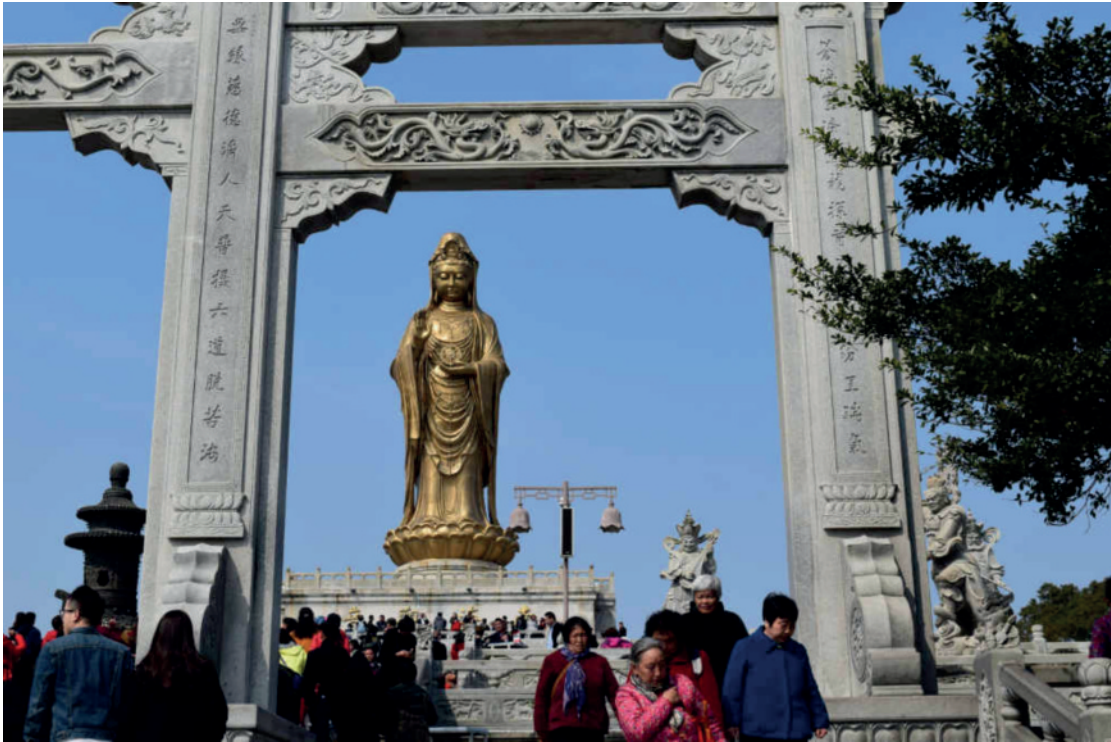
Figure 4: Religious tourism on Putuoshan, China.