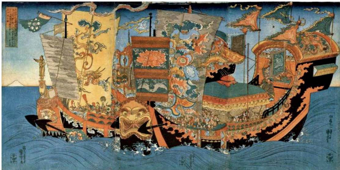
Figure 1: Mid-19th Century illustration of Xushi’s 219 BCE quest for the sacred islands, by the Japanese artist Utagawa Kuniyoshi. (Source: Wikimedia Commons, https://commons.wikimedia.org/wiki/File:Xu_Fu_expedition%27s_for_the_elixir_of_life.jpg )

Although these descriptions of quests for the three sacred islands may sound like the stuff of legend, the court official Xushi (徐市, also known as Xufu (徐福)) truly did set out in search of the islands on two separate occasions, in 219 and 210 BCE, at the behest of Emperor Qin Shihuang (秦始皇). Records of the Grand Historian mentions Xushi’s quest over ten times.