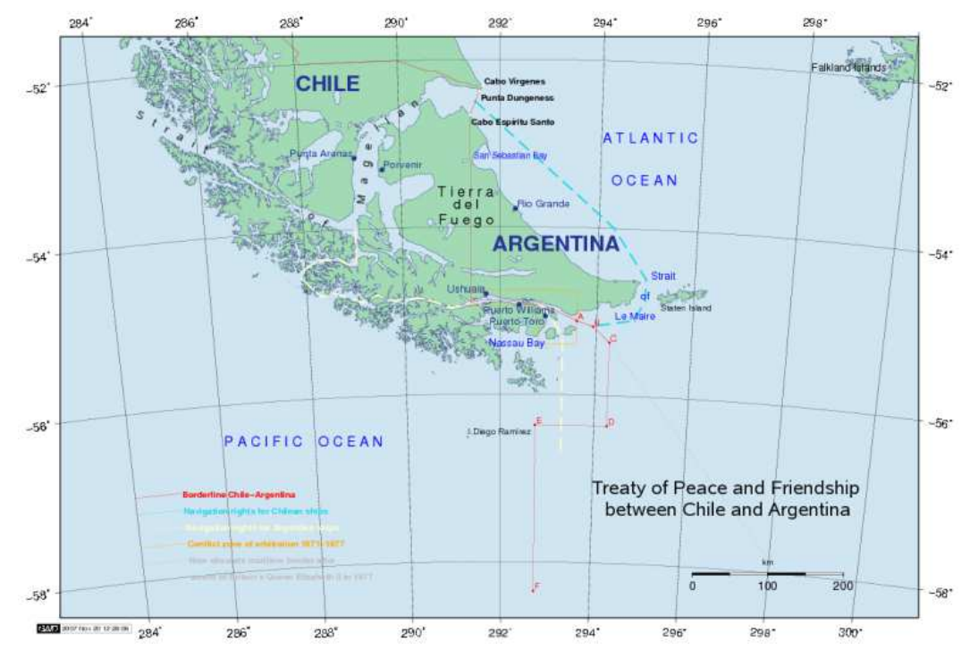
Figure 3: Border and navigation rights as defined by the Treaty of Peace and Friendship.

On 19 October 1984, the Treaty's contents were published. Like previous verdicts, this Treaty also recognized the legitimacy of the Border Treaty of 1881 . Also, it held on to the border determined by the Arbitration of 1977 . From its eastern extreme, it extended the limit by connecting six coordinates, establishing the maritime border between both countries. While the islands were recognized as Chilean, this line actually allots to Argentina most of the archipelago's Exclusive Economic Zone to the east of Cape Horn (see Figure 3).