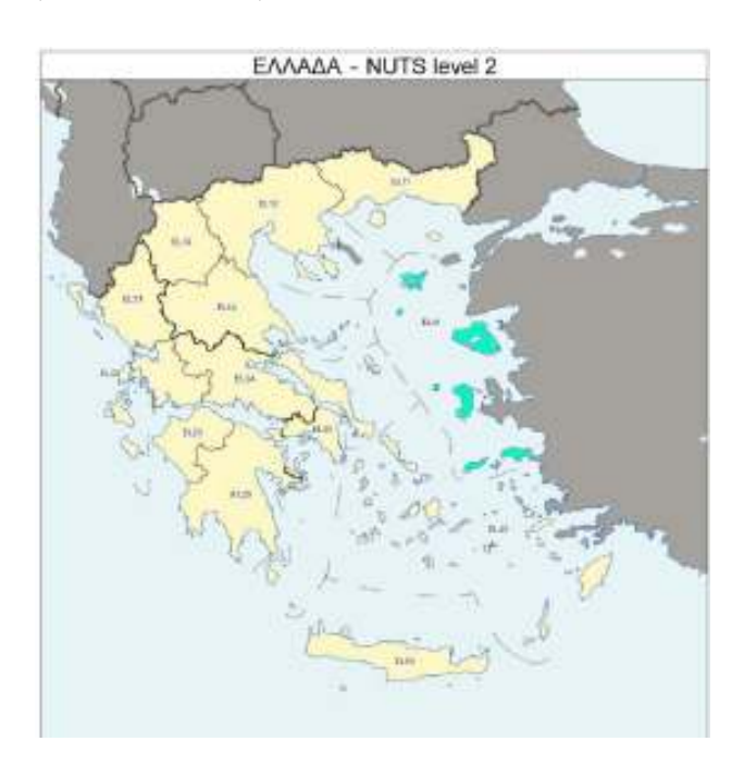
Location of island of Lesvos (Source: Eurostat)

Location of Voreio Aigaio (Source: Eurostat)