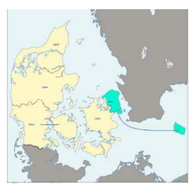
Location of the island of Bornholm (Source: Eurostat)

Location of Hovedstaden (the Copenhagen capital region, to which Bornholm belongs adminstratively) (Source: Eurostat)