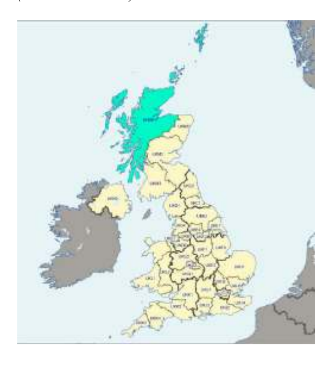
Location of Western Isles of Scotland (Source: Eurostat)

Location of the Highlands and Islands (Source: Eurostat)