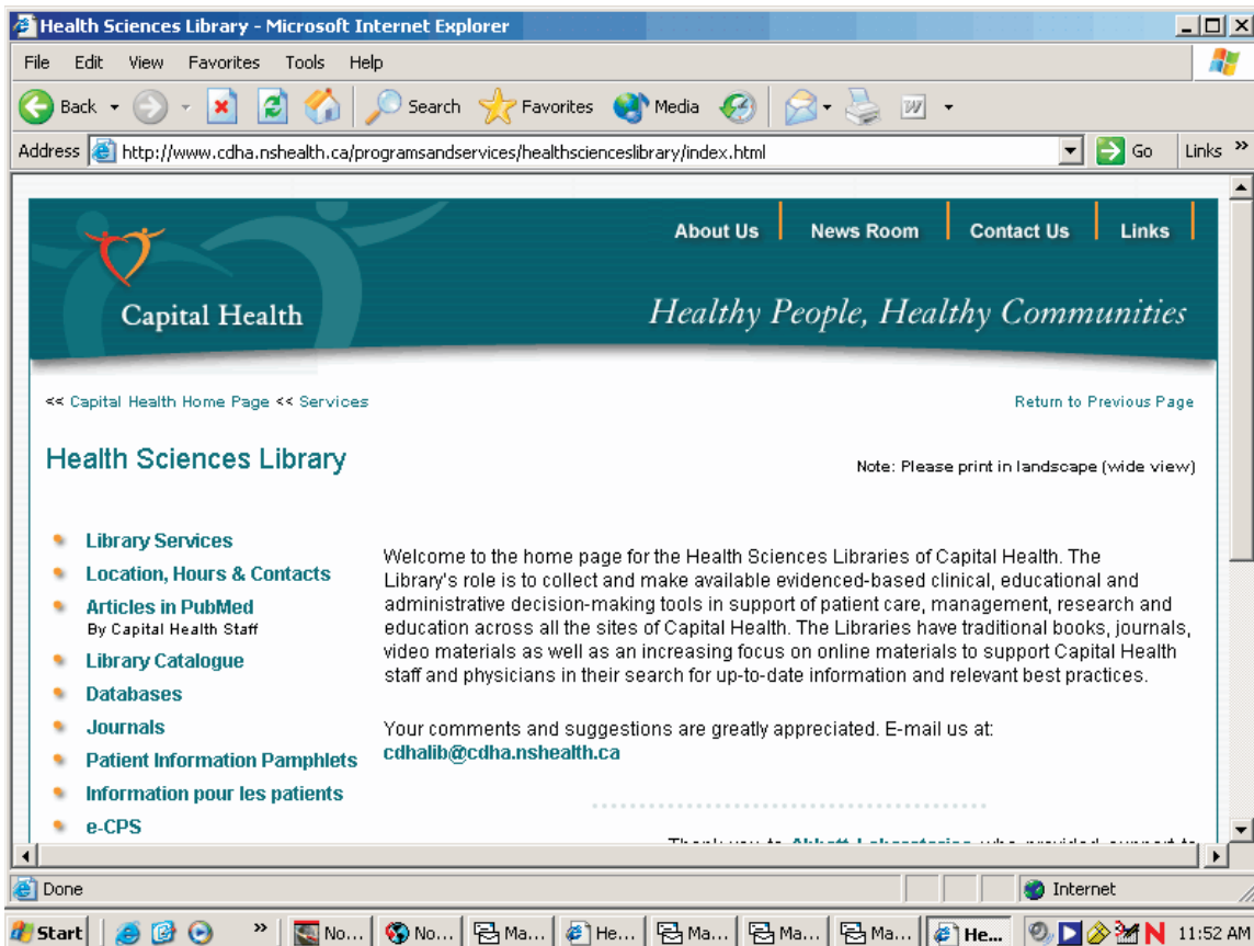
Fig. 3. Link to the French language page.