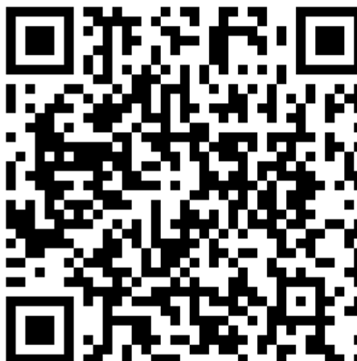
Figure 1. Link to Video Summaries of Interviews