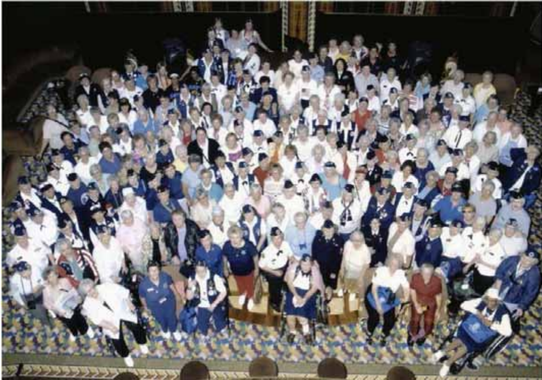
Image 6. WAVES National Convention Group Shot, Caribbean Sea, 22 September 2006 135

Perhaps the women did not want a WAVES and SPARs memorial as World War II came to a close because they had been so well integrated into the wartime family and thus it would have seemed redundant to honour only women; instead a full Navy memorial would do. It was only after the war ended that they realized that their silence led their contributions to be overlooked. So they began to reassert their military family ties. They attended WAVES National conventions and successfully pushed for a memorial for female veterans in Washington, D.C.