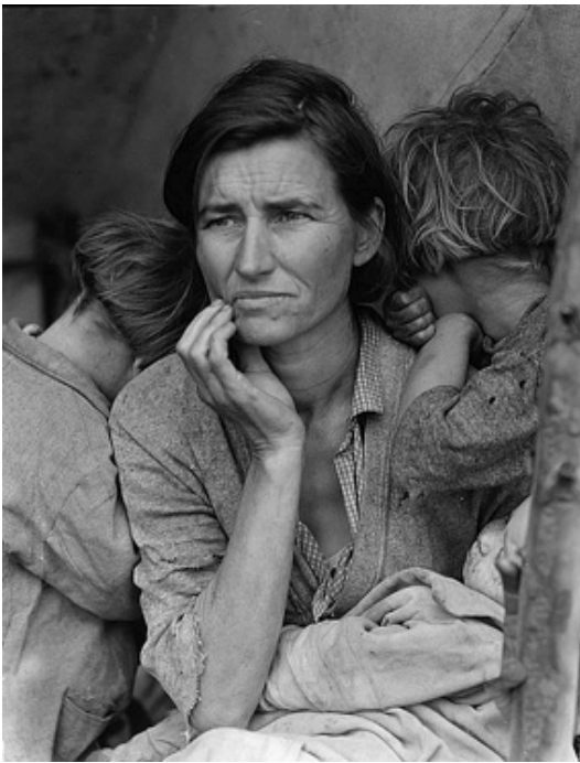
Image 3. Destitute Pea Pickers in California; a 32-year-old mother with seven children, circa 1936. 25

The group of women interviewed for this project seem vastly different from the stereotypical portrait of Depression-era American women seen in popular culture, such as the struggling migrant mother found in Dorothea Lange's famous 1936 photograph.