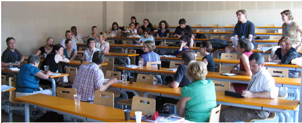
Representatives of national oral history associations discuss how to best start a new association

A dozen special interest groups met in Prague, including the national oral history associations. Representatives from Australia, Canada, South Africa, the United States, the United Kingdom, Ukraine, Germany, Ireland, Spain, Italy, Portugal, Brazil, Argentina, Greece, the Czech Republic, Slovakia, and Japan attended. Other countries with associations, such as Singapore, Austria, and New