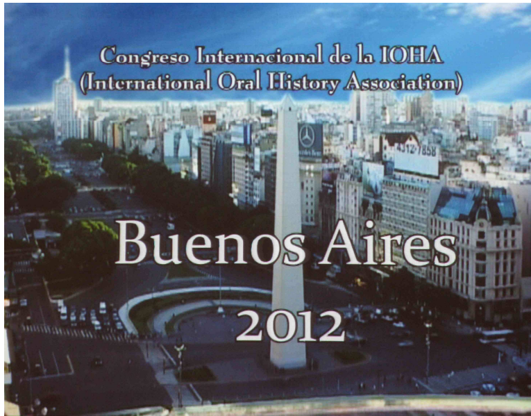
Screenshot from the Buenos Aires video

A dozen special interest groups met in Prague, including the national oral history associations. Representatives from Australia, Canada, South Africa, the United States, the United Kingdom, Ukraine, Germany, Ireland, Spain, Italy, Portugal, Brazil, Argentina, Greece, the Czech Republic, Slovakia, and Japan attended. Other countries with associations, such as Singapore, Austria, and New