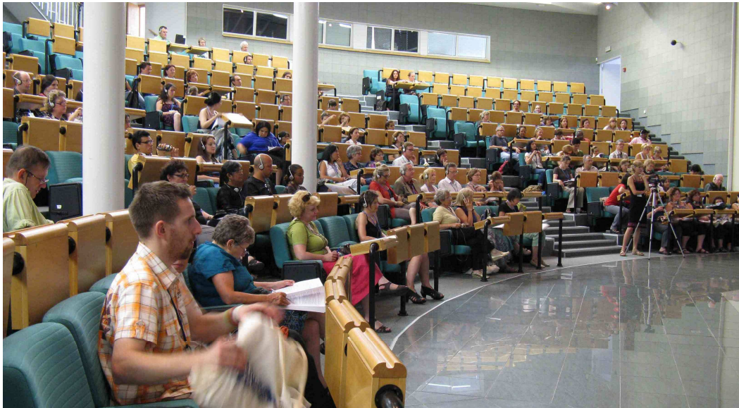
IOHA General Meeting

acclaimed author, former president of the Czech Republic, and Nobel Prize Winner emphasized: “Without oral history, many things would undoubtedly remain forgotten for good.”