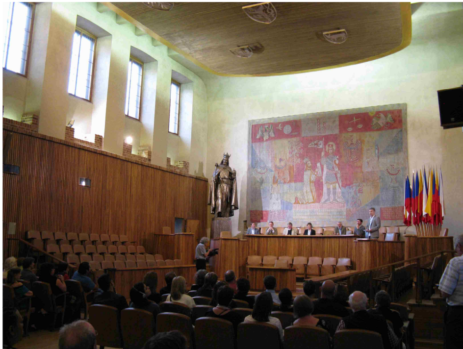
Opening Ceremony at the Karolinum, Charles University

The International Oral History Association held its 16 th biennial meeting in Prague, the capital of the Czech Republic, in July 2010. Under the umbrella theme “Between Past and Future: Oral History, Memory and Meaning,” some 500 oral historians from over fifty countries and all continents presented their research on the campus of the University of Economics. The presenters addressed the conference’s sub-themes, including memories of violence, war and totalitarianism; memory and politics; islands of freedom; memories of family; the world of work; gender/ing memories and the making of sexual identities; health and healthcare; ecology and disasters; sharing/passing on beliefs; organizing oral history; methodological, archival, and technological issues; teaching oral history; and oral history and the media. The meeting was preceded by one day of Master Classes – intensive workshops with leaders in the field – about oral history and education, subjectivity, evidence, trauma, memory, and the life-story interview.