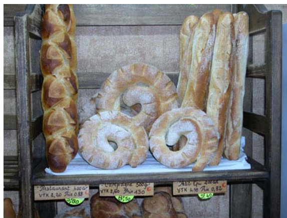
“Pain de fossile” offered for sale in the local boulangerie at Grouen. The loaves are shaped like snails and are modeled after the nearby famous fossils that were painted bright colors by vandals.

An investigator from the Institut de Paléontologie said that the paint had penetrated into the pores of the rock and that they could not be