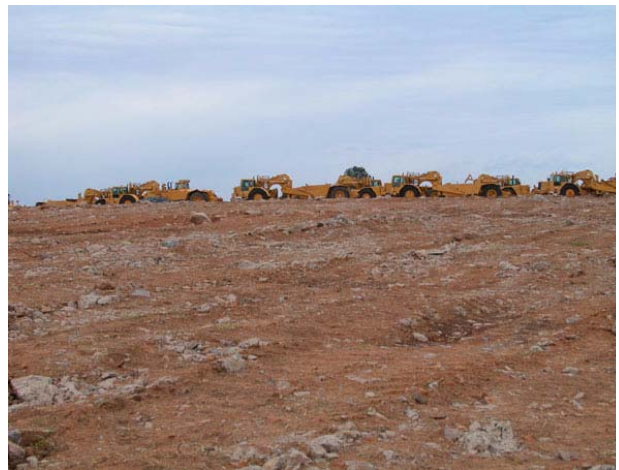
Bulldozers and loaders lined up beyond the destroyed "trilobite herds."