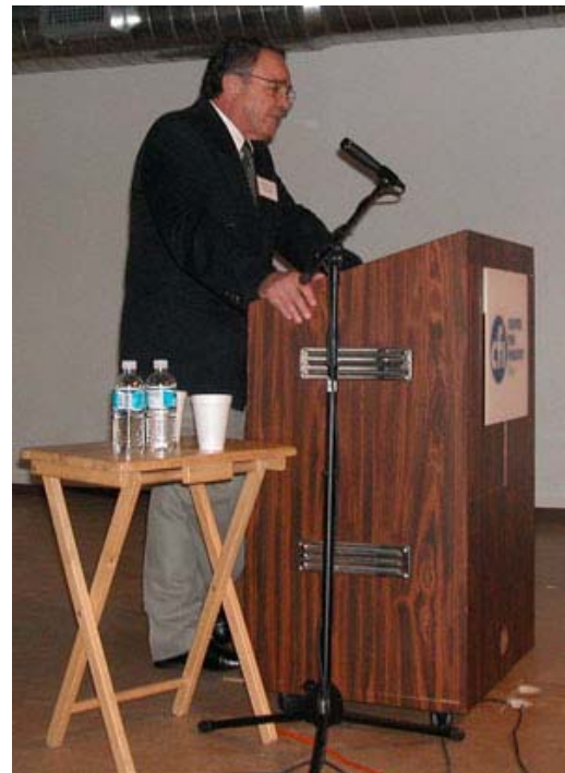
The President, on the steps of the Rose Garden, announces his fossil collecting Executive Order. “If Jefferson could collect old bones, then we can all do it.”