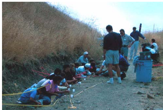
Science classes from Middlesex School collecting fossils at the Family Quarry under the close scrutiny of their science teachers.