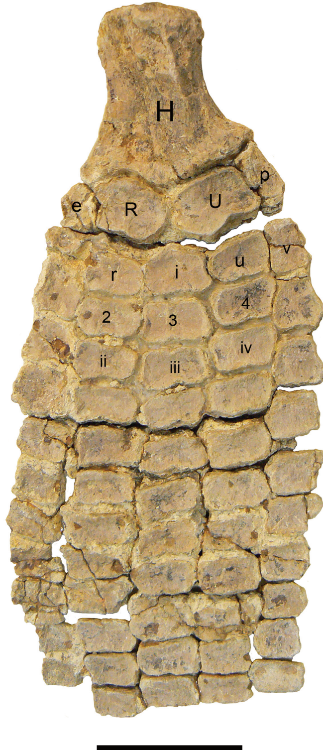
FIGURE 6. Left forelimb of DMNH 11843 in dorsal view. Abbreviations: e, extra zeugopodial element; H, humerus; I intermedium; p, pisiform; R, radius; r, radiale; U, ulna; u, ulnare. Arabic numerals are distal carpals, roman numerals are metacarpals. Scale equals 10 cm.