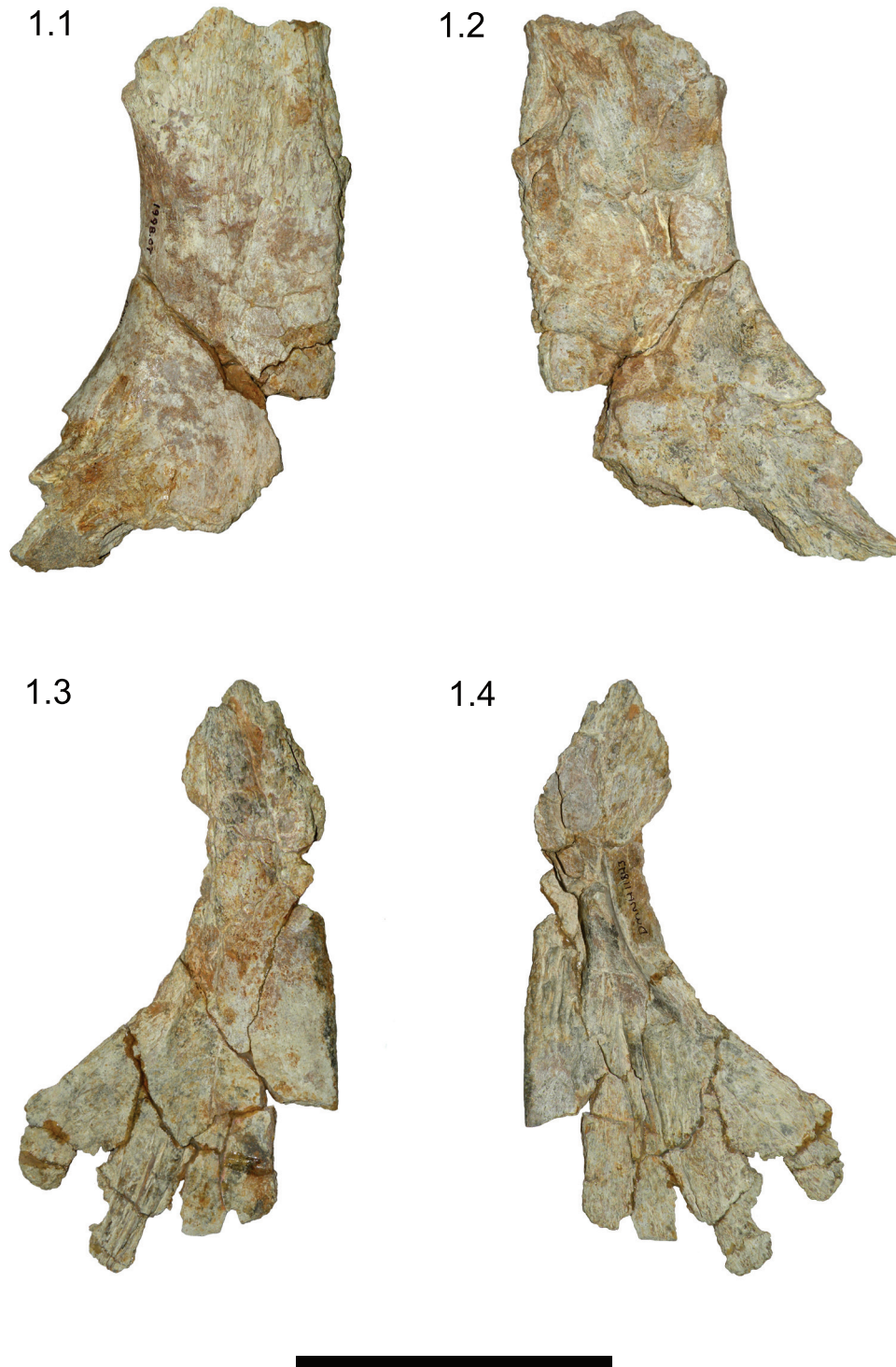
FIGURE 1. Cranial elements of DMNH 11843. 1.1 parietal, dorsal view, 1.2 ventral view; 1.3 postfrontal, dorsal view, 1.4 ventral view. Scale equals 10 cm.