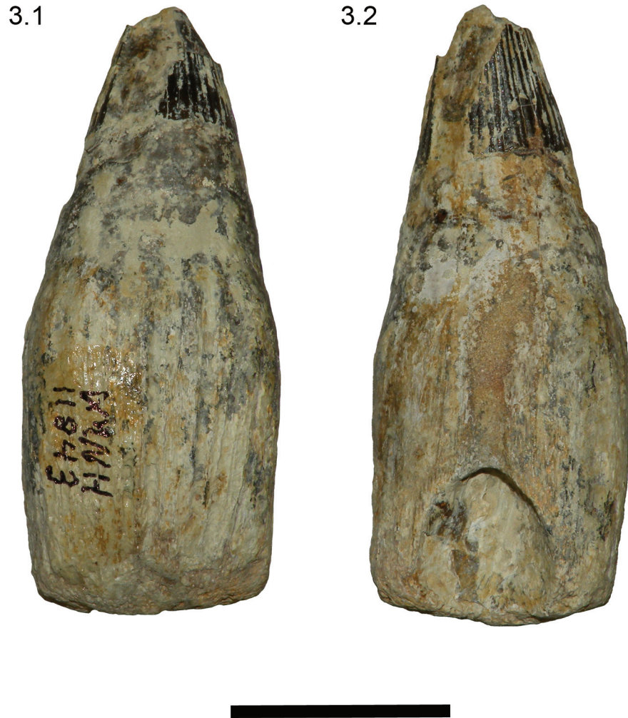
FIGURE 3. Tooth of DMNH 11843 3.1 labial and 3.2 lingual views. Scale equals 2 cm.