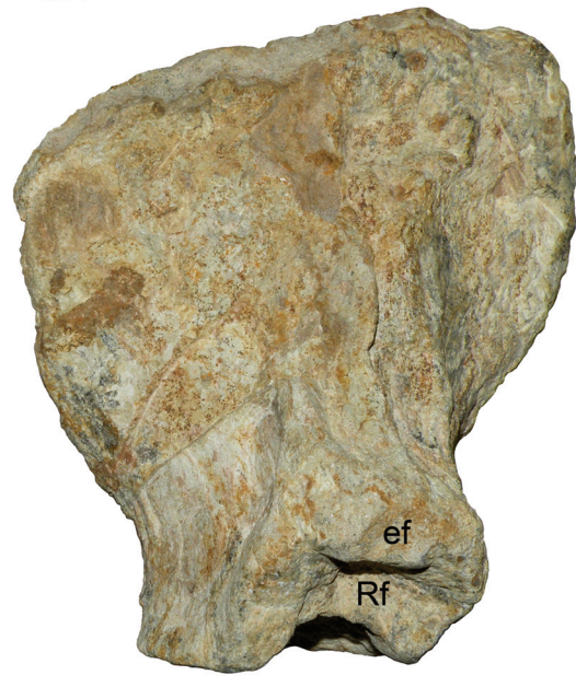
FIGURE 5. Right humerus of DMNH 11843. 5.1 posterior view; 5.2 anterior view. Abbreviations: ef, facet for extra zeugopodial element; pf, facet for pisiform; Rf, facet for radius; Uf, facet for ulna Scale equals 10 cm.