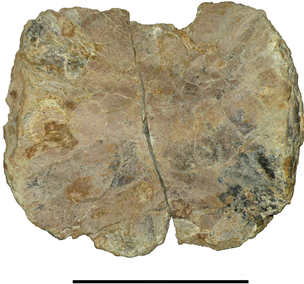
FIGURE 4. Right coracoid of DMNH 11843 in dorsal view. Scale equals 10 cm.

sionally via small facets. Given the amount of variability in Platypterygius Huene 1922 forelimbs, the presence of facets for an extra zeugopodial and pisiform element may not be a definitive character for diagnosing species.