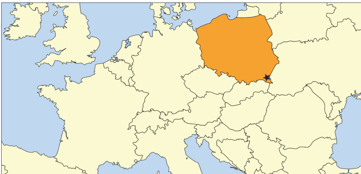
FIGURE 1. A map of Europe with Poland (orange) and the location of the village of Hłudno (asterisk) in southeastern Poland, where the specimen ZPALWr. A/4005 was found.

(Bochenski et al., 2011) and Resoviaornis jamrozi Bochenski, Tomek, Wertz, and Swidnicka, 2013 (Bochenski et al., 2013a). All three species are dated to the early Oligocene, and their systematic position within Passeriformes remains unresolved because they show a mosaic of characters typical for the Oscines or Suboscines. Another complete specimen of a passerine bird was found in the early Oligocene of Lubéron, France, but it has not been described yet (Mayr, 2009). The remaining Oligocene remains described in the literature include an articulated wing (Mayr and Manegold, 2006b) and a handful of isolated wing bones – those from the late Oligocene represent both Oscines and Suboscines (Manegold, 2008; Mourer-Chauviré et al., 1989). Leg bones and especially their distal elements are even rarer. Legs of Wieslochia weissi , Jamna szybiaki and Resoviaornis jamrozi are incomplete. Only one specimen of a complete articulated passerine leg is known from the Oligocene (Bochenski et al., in press). Apart from it, only two other fragments of the tarsometatarsus are known from the Oligocene of France (Mourer-Chauviré, 2006; Mourer-Chauviré et al., 1989, 2004).