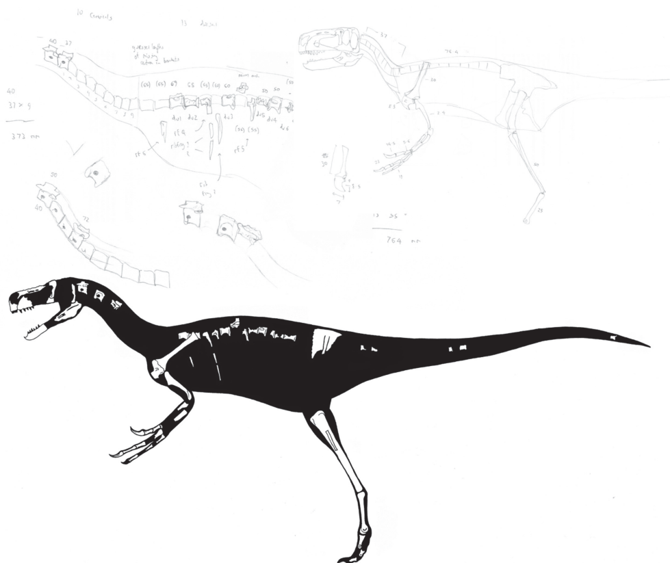
FIGURE 2. The production of a skeletal reconstruction (and hence a life restoration) involves the compilation of collected measurements and a rigorous effort to properly determine the proportions of the animal involved. This compilation - depicting the Lower Cretaceous theropod dinosaur Eotyrannus lengi - shows how measurements and proportions were compiled in order to create the conservative reconstruction shown at bottom. A more technically competent illustrator might use the same technique to reconstruct an animal via digital means only. Image by Darren Naish.

mals, accurate palaeoart is constrained by a wealth of data (see Conway et al. 2012 and Witton 2014a for overviews). This does not mean that palaeoartworks are necessarily 'right' or 'wrong', but that the most credible efforts which portray extinct creatures in accordance with scientific evidence. Credible palaeoartwork requires up-to-date knowledge of the taxon being illustrated and the geological context in which it occurs; an ability to reconstruct missing anatomical details (e.g. missing skeletal components and soft tissues) using inference from extinct and modern species; knowledge of those poses and actions which are biomechanically tenable; an understanding of animal colouration and behaviour and, of course, the ability to produce an artistically compelling piece of work in the first place. In contrast, objectively inaccurate works distort proportions measurable from fossils, omit integumentary structures documented for the taxon concerned, include blatant anatomical errors (regarding, for example, digit number or limb