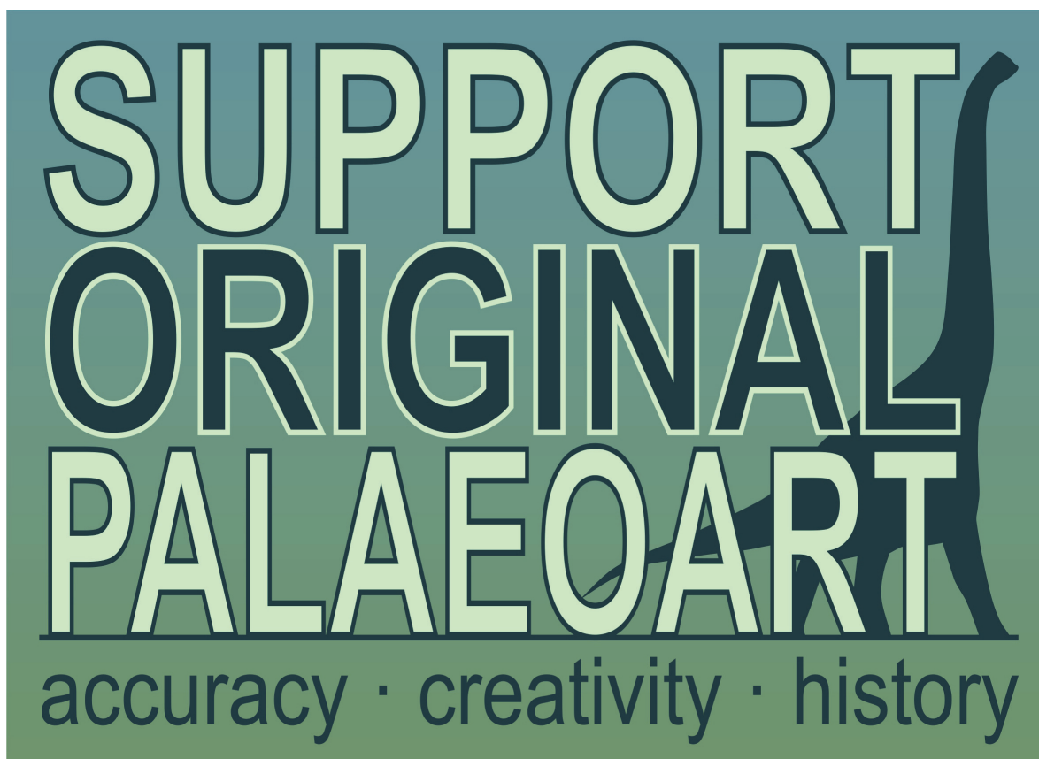
FIGURE 5. Fair working practises for palaeoartists can only develop if individuals involved with producing, commissioning and purchasing palaeoart push against the current climate of poor culture, inadequate financing and loose ethics. Concerned individuals should raise awareness and encourage discussion of these issues wherever they can, and especially so in the mostly-offline venues where palaeoart is produced or procured for palaeontological media. This graphic is offered as a free, unrestricted means of clearly stating support for this cause.

credence and appeal to projects they are involved with. This is far from a fanciful aim, since it is well known in palaeontology in general (and not palaeoart alone) that several individuals are consistently associated with high-quality products and bring credence and gravitas, and not 'just' technical competence and accuracy alone, to a project.