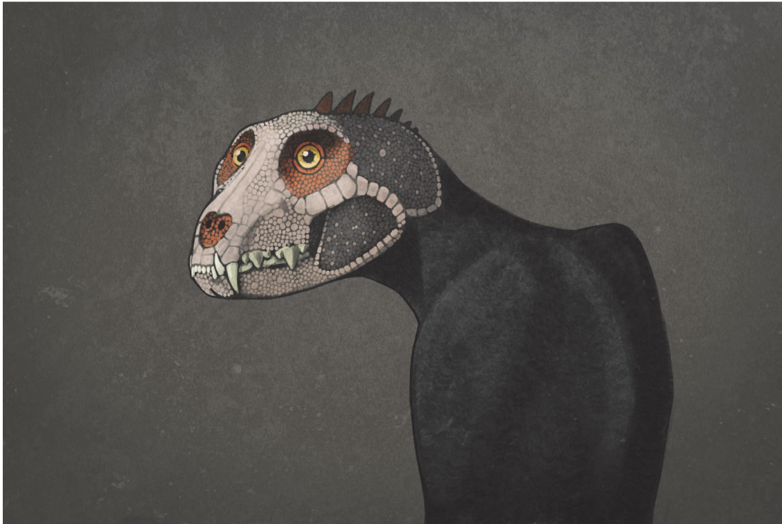
FIGURE 3. If artists made major mistakes in depicting the anatomies or proportions of modern animals - such as restoring a cat with scales, as shown here - their work would be considered an abject failure and future commissions unlikely. Fossil animals are frequently depicted with equivalent gross inaccuracies however, because many artists employed for palaeoart projects do not research or familiarise themselves with fossil data, or receive minimal guidance by consulting scientists. Painting by John Conway.

ingly, palaeoart tropes stifle the growth of the field as both an art form and an attempt to realistically portray past animal life. In particular, the near-constant depiction of extinct forms in aggressive, 'threatening' poses reinforces the idea that palaeoart only caters to young, excitable audiences or 'fanboys', and is not as sophisticated as other forms of natural history art (Witton 2014b). This impacts the value and respectability of the palaeoart industry, and ultimately the tenability of palaeo-artistic careers.