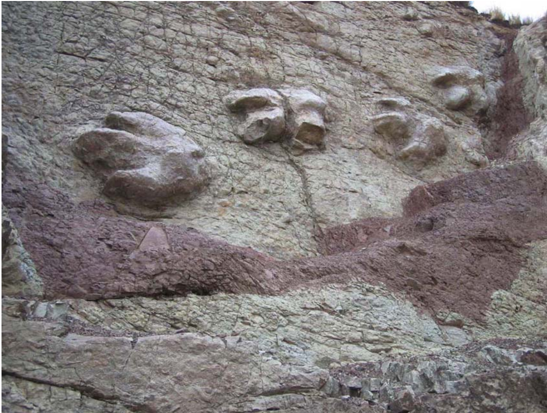
FIGURE 6. Early Albian theropod tracks, discovered at 4600 meters above sea level in Ancash.