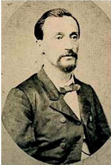
FIGURE 2. Antonio Raimondi.

The main challenges in today's Peruvian paleontology are the absence of formal, college-level curricula, the scarcity of local research centers; limited funding sources, and the lack of an effective law for protection of our paleontological heritage.