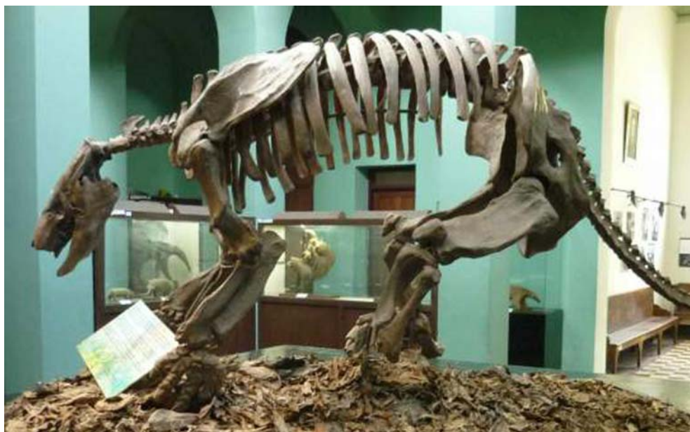
FIGURE 5. Scelidodon chiliensis skeleton in Exhibition Hall of UNMSM Museum.