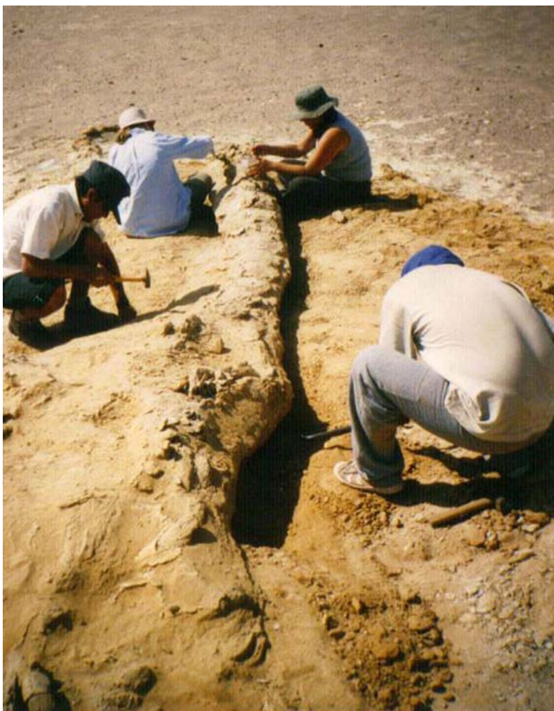
FIGURE 4. Unearthing a fossil cetacean in Middle Miocene beds of the Ica Desert, southern Peru.