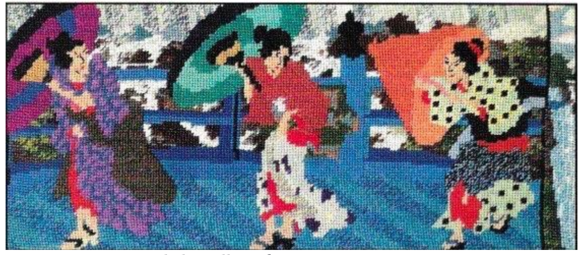
Untitled needlework, cotton on cotton canvas