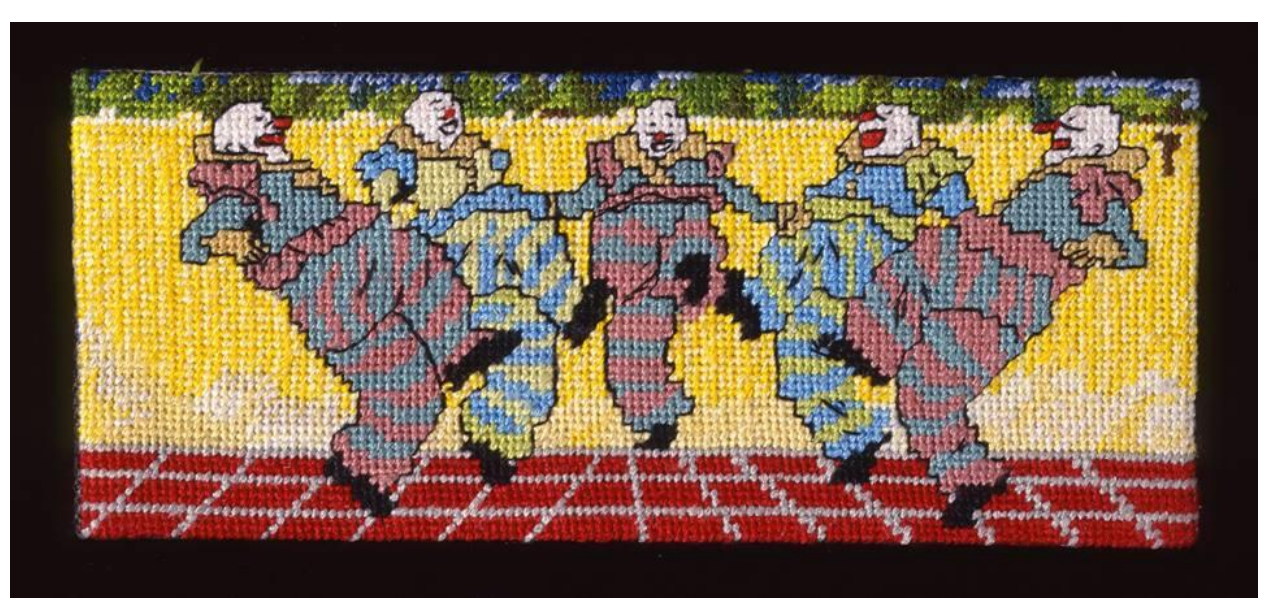
Untitled needlework, cotton on cotton canvas