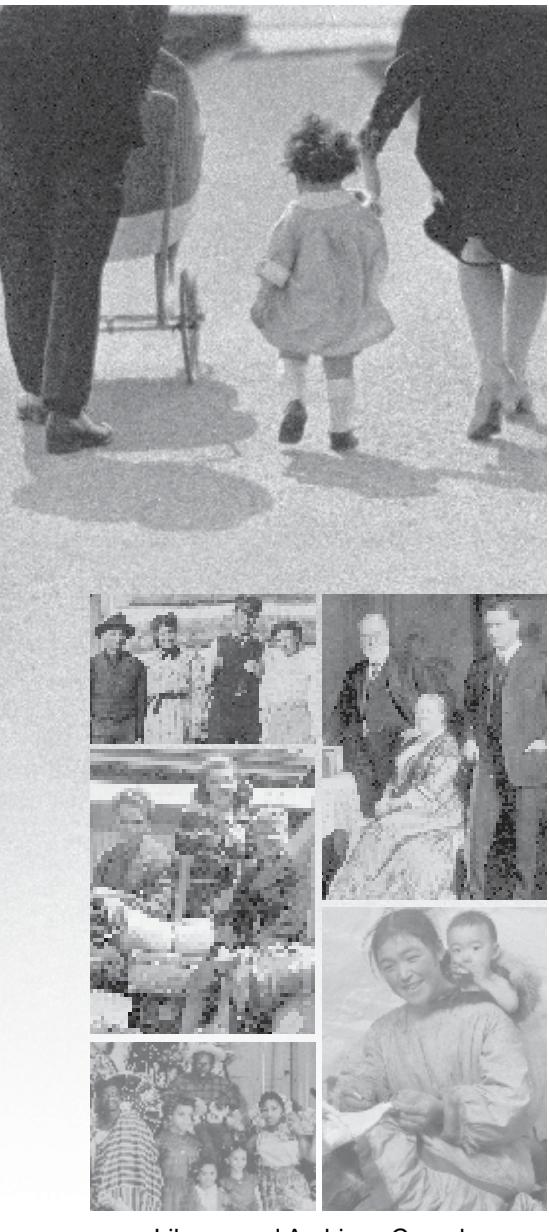
Library and Archives Canada Canadian Genealogy Centre