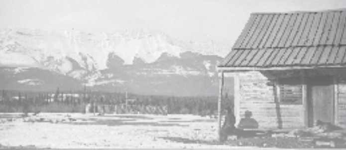
In the Jasper House Valley looking west, January 15, 1872 (PA-009149)

You can access a specific record held by Library and Archives Canada by one of the means described below. More detailed information about our services can be found under <a href="What to Search: Topics: How to Access Library">What to Search: Topics: How to Access Library and Archives Canada Records.</a>