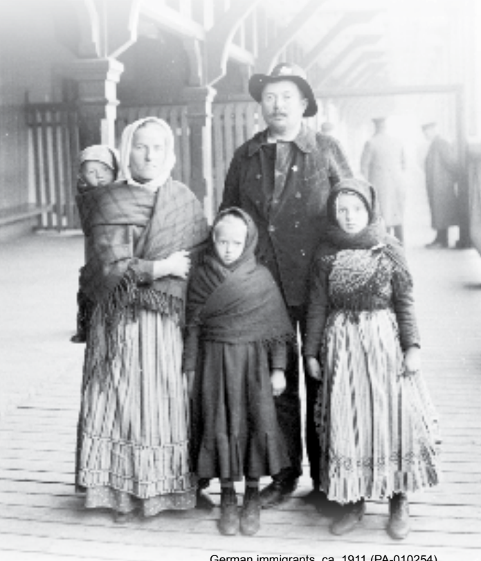
German immigrants, ca. 1911 (PA-010254)

Email inquiries should be sent through our website at www.collectionscanada.gc.ca/genealogy, using the online form accessible under Ask a Question.