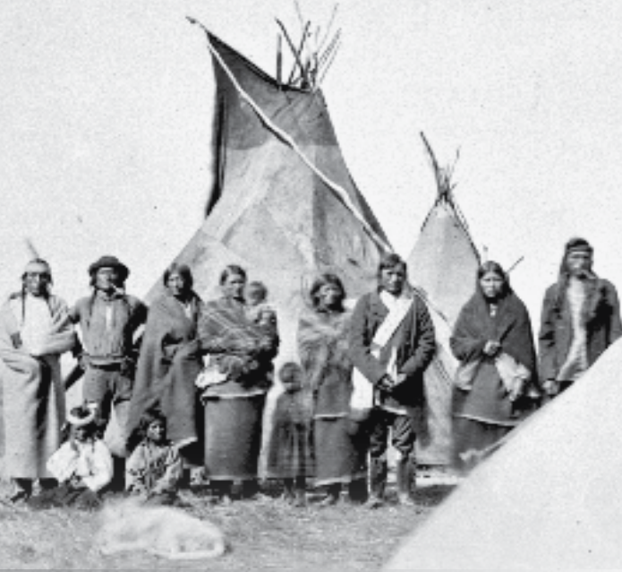
Group of Dakota (Sioux) Indians at Turtle Mountain, 1873–1875 (PA-074652)

In order to determine if one of your ancestors was of Aboriginal origin, you should first compile a family tree, using standard genealogical sources. Identify your ancestor by name, date of birth, marriage and death, and place of residence. A census record is often the only source that indicates if a person was of Aboriginal origin.