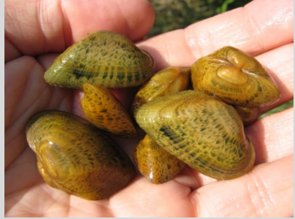
The Ausable River population of the Snuffbox (Endangered) is one of the only two known populations in Canada. The range of sizes shown above (including juveniles) is indicative of a healthy population.