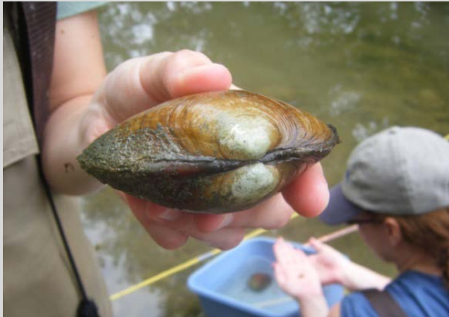
Monitoring results for the Wavy-rayed Lampmussel (above) has shown this species to be more widespread within the Ausable River than previously known. The species was originally assessed by COSEWIC as Endangered, but was recently re-assessed as Special Concern.

Although more work is needed to protect habitat for aquatic species at risk, including endangered freshwater mussels, the continued commitment from federal and provincial agencies provides landowners with incentives to restore and recover the Ausable River ecosystem.