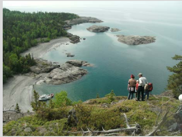
Pukaskwa National Park.

Ontario's recovery program for the Peregrine Falcon is part of a larger Canadian and North American effort to restore this species to its former range. Pukaskwa National Park contributes to this initiative not only through the protection of its habitat but also by monitoring and reporting on the number of individuals found within the park, thereby increasing our knowledge of the progress of the recovery of the species. The good news is that the three Peregrine Falcon territories in use since 2000, with a nest in each territory, have been consistent in producing fledglings. In 2011, six fledglings were observed with one or more in each of the three nests.