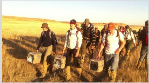
Black-footed Ferrets being brought to their new prairie home.

The first introduction of Black-footed Ferrets to re-establish a population in Canada occurred in Grasslands National Park in October 2009. Their survival over the harsh Saskatchewan winters was a major concern and required careful monitoring of the ferrets during their first winter. The effort was rewarded by the sighting of young kits, which confirmed not only their survival but better yet, their breeding success. Since 2010, monitoring volunteers have recorded four wild-born ferret families exploring their nocturnal habitat at four different prairie dog colonies. The discovery of new families is confirming how quickly the ferrets are adapting to their new home on the Canadian prairies. Volunteers enjoyed this unique experience of roaming a prairie landscape at night and were greatly appreciated by park staff for their hard work and dedication to this project.