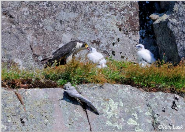
Peregrine Falcon feeding chicks.

Pukaskwa National Park of Canada staff first noticed that the Peregrine Falcon anatum ( Falco peregrinus anatum ) had returned to the park in 1998, when two adults were observed displaying breeding behaviour. Found throughout North America, the populations of Peregrine Falcon were dramatically reduced by the widespread use of DDT during the latter half of the 20th century. Falcon ingested DDT from their prey which not only disrupted their breeding behaviour but also resulted in the production of thinner eggshells. Peregrine Falcon anatum , one of three subspecies, endured the greatest population collapse. By 1975, only 35 nesting pairs remained in Canada.