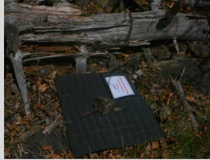
Made of black fiber-glass roofing material and measuring 30x60 cm, artificial cover objects installed on the Observatory Hill property increase the chance of capturing Sharp-tailed snake.