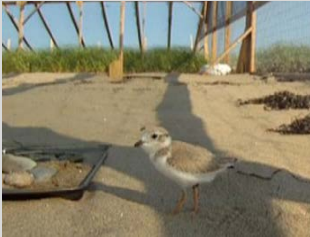
Piping Plover in an outdoor flight pen.

This Piping Plover captive rearing project is the first of its kind in eastern North America and is funded by Parks Canada. It is a cooperative effort between Parks Canada, the Magnetic Hill Zoo (MHZ) and Wildlife Preservation Canada to salvage abandoned plover eggs from beaches in Prince Edward Island and Kouchibouguac National Parks of Canada.