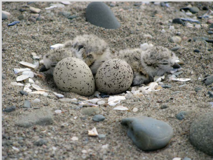
Piping Plover chicks hatching in Gros Morne.

Parks staff kept an eye on this site and in June 2009, something hopeful happened in Gros Morne. After an absence of 34 years, a Piping Plover was seen at Shallow Bay! Over the following days, a pair was seen courting and, within two weeks, a seasonal closure was placed on the section of beach where they had settled. Park staff used this opportunity to engage the local community and the media to increase public understanding of the plight of plovers throughout Newfoundland. The birds did their part too. A nest was established and four chicks fledged that summer. More importantly, the plovers returned to nest at Shallow Bay in 2010 and 2011.