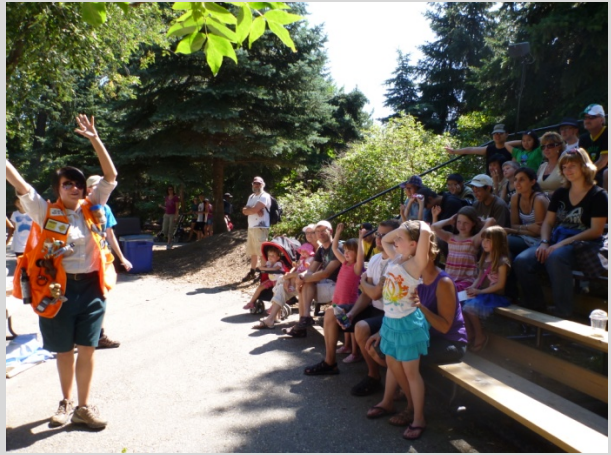
Outreach activities at the Calgary Zoo.

In August 2011, the Canadian and American teenagers who won the Robert Bateman Get to Know art contest were offered the trip of a lifetime. They visited the Gulf Islands National Park Reserve and Fort Rodd Hill National Historic Site for a week-long summer camp, which included activities on species at risk. At Gulf Islands National Park, Parks Canada staff and a Hul'qumi'num Elder gave a presentation on the Southern Resident Killer Whale, Harbour Porpoise, Steller Sea Lion and the Golden Paintbrush. The teenagers then travelled to Fort Rodd Hill National Historic Site to help remove invasive species in the Garry Oak Ecosystem, an important home for many of Canada's species at risk.