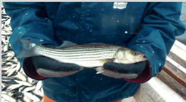
A fishing crew from Eel Ground First Nation caught this Striped Bass in the trap net located on the Miramichi River. The Striped Bass monitoring program has been conducted for the past four years.

Waters of the Eel Ground First Nation are adjacent to the only known spawning grounds for Striped Bass (Southern Gulf of St. Lawrence population) and so awareness of the habitat needs of this species was also very important for this community. The project engaged youth to learn about Striped Bass protection and recovery, and to share this knowledge with other community members. Taking such an active role in species recovery generated a lot of interest and pride from the youth, fishers and others in these communities. It is hoped that the community awareness, stewardship and conservation efforts by all resource users will result in an increased population of Striped Bass in the very near future.