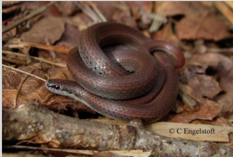
The endangered Sharp-tailed snake is secretive and semi-fossorial, which makes it very difficult to find.