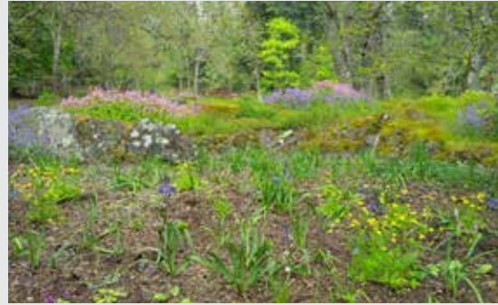
Garry Oak Ecosystem

In 2003, Parks Canada committed to lead on recovery planning for 42 plants and invertebrates that are part of Garry Oak and associated ecosystems. Parks Canada, in partnership with the Garry Oak Ecosystem Recovery Team, has worked with private landowners, local governments, non-governmental organizations, other federal departments and First Nations throughout the region to successfully publish recovery strategies. The final recovery strategy, for Slender Popcornflower, was posted in September 2014 and represents the completion of more than a decade of planning for the recovery of Garry Oak species and the ecosystems they call home. With these recovery strategies as their guide, Canadians now have a framework to preserve these ecosystems for future generations.