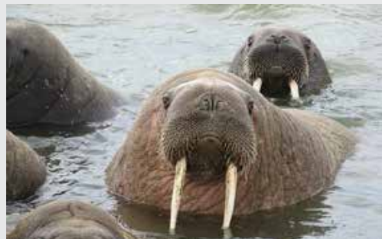
Atlantic Walrus

By artfully bridging generations, the 44-minute instructional video demonstrates to young hunters the harvesting process of catching, skinning and butchering the walrus to reduce losses (walrus that are shot but not retrieved). Currently, loss rates for Atlantic walrus can be as high as 32%. This first-of-its-kind video will record and preserve traditional Inuit hunting practices for future generations and at the same time protect a culturally important species at risk.