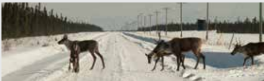
Boreal caribou

Lastly, AWN collected data on 21 caribou sightings and 427 physical barriers constructed to deter highway vehicles from gaining access to the caribou habitat zones. It is expected that this data will contribute to a better understanding of population structure, trends and distribution over time in relation to habitat conditions and disturbance, as well as to determine whether physical barriers are effective in reducing vehicle access to caribou habitat.