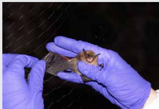
Little Brown Myotis captured at the tunnel entrance at the Fortress of Louisbourg National Historic Site

One conservation initiative consists of monitoring bats using digital recorders at a historic tunnel at the Fortress of Louisbourg National Historic Site. This initiative is conducted in partnership with bat researchers from St. Mary's University and the Atlantic Coastal Action Program in Cape Breton. Automated sound detectors near the tunnel entrance have recorded the echolocation clicks of Little Brown Myotis and Northern Myotis. Both species use the tunnel to roost and to hibernate. Parks Canada staff collaborated with bat researchers to capture bats at the tunnel entrance to determine species, numbers and health. As of August 2014, the fungus causing white-nose syndrome has not been detected in the tunnel.