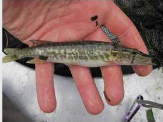
Grass Pickerel

The species' confirmed presence in a new area is an encouraging sign for its recovery. Other measures will be implemented in the coming years to learn more about the Grass Pickerel population in Quebec and to ensure its protection.