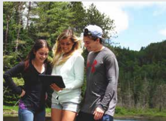
Young visitors using the Nature BioKit at Mauricie National Park

Following their field visit, users can share and compare notes with their friends and share their diagnosis on the website BioKits. BioKit is a new way to tell and be told about nature.