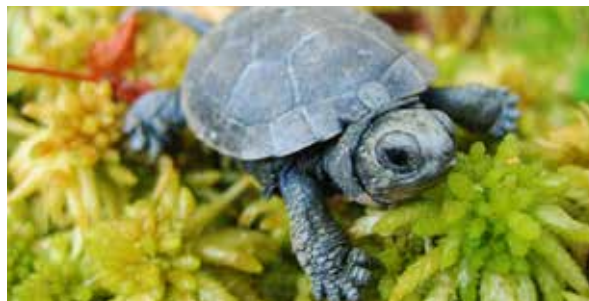
A newly-hatched Blandings turtle