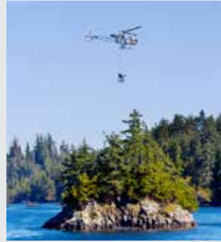
Aerial treatment for eradication of rats