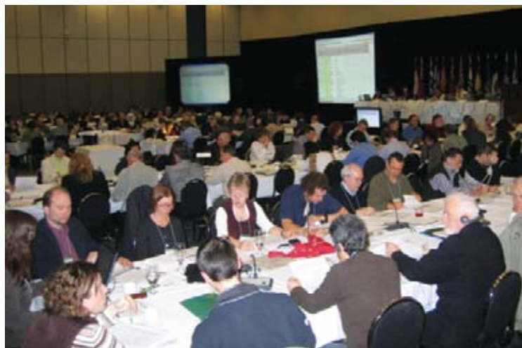
Participants of the 2008 Canadian Minor Use Pesticide Priority Setting Workshop

For many growers, especially those who specialize in low-acreage, high-value crops, the answer is often "all of them," because it seems there's always a sizeable crowd of bugs, moulds, fungi, rusts, blights or weeds that want to complicate your life. Some cause